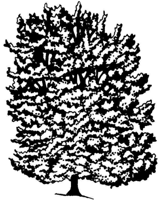
Figure 1. Mature Acer rubrum : Red Maple

Availability: not native to North America