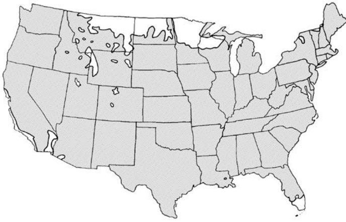
Figure 2. Range