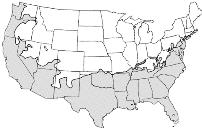
Figure 2. Range