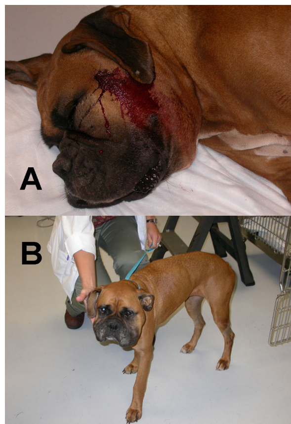
Figure 1. This boxer was bitten by an Eastern Diamondback Rattlesnake (a pit viper). When the dog arrived at the vet soon after the bite (A), the bite was bleeding and beginning to swell, and the dog was highly lethargic. After receiving proper medical treatment (B), this boxer was feeling much better and was able to return home.

If a pet does not receive prompt medical care at an animal clinic, its prognosis for recovery is poor, especially if the bite was from a Cottonmouth, Eastern Diamondback Rattlesnake, or Coral Snake. With prompt and adequate care, including delivery of antivenin, most dogs survive bites of Cottonmouths and Eastern Diamondback Rattlesnakes. Also, bites to dogs by Pygmy Rattlesnakes and Copperheads are