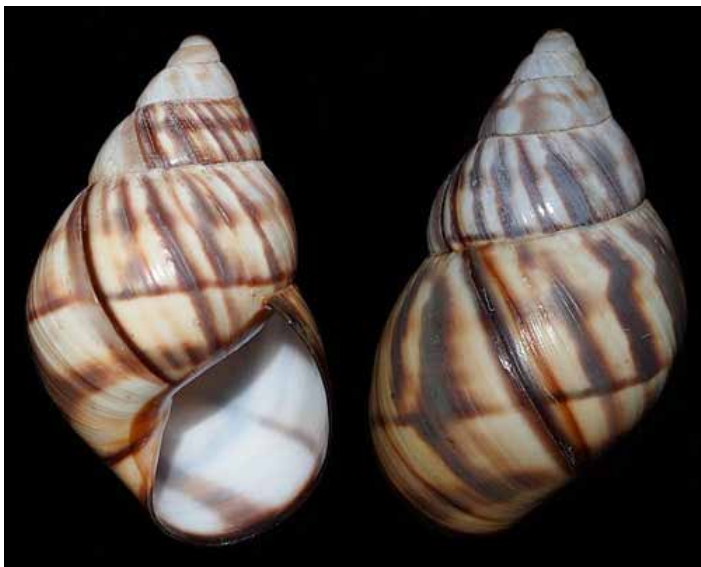
Figure 10. The Florida Keys tree snail, Orthalicus reses nesodryas Pilsbry 1946.

7. Apex and parietal callus dark chestnut-brown . . . . . Florida Keys treesnail, Orthalicus reses nesodryas (Pilsbry 1946). This subspecies is endemic to the Florida Keys, from Lower Matecumbe Key to Key West, and can be found on a variety of host trees.