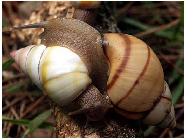
Figure 7. The color patterns of the Florida tree snail, Liguus fasciatus (Müller), are extremely variable.

The color patterns in this species are extremely variable. At this time, there are 58 named color forms in South Florida and the Florida Keys (Davidson 1965, Jones 1979, Diesler 1982), with others in Cuba. This animal is generally found on smooth-barked trees in native hammocks.