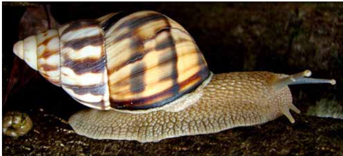
Figure 9. The Stock Island tree snail, Orthalicus reses reses (Say 1830).

Pilsbry, have been confused with the foreign snail Achatina fulica (Bowdich). However, they can be differentiated from A. fulica because they have a greyish cast (never reddish) to the stripes, underlying spiral bands, and a columella continuous with the aperture, not truncate. O. r. reses is endemic to Stock Island, Monroe County, where it is found on a variety of native and exotic trees.