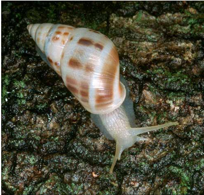
Figure 5. The Manatee treesnail, Drymaeus dormani (Binney 1857).

and has been reported on palmetto, orange and grapefruit trees (Pilsbry 1946).