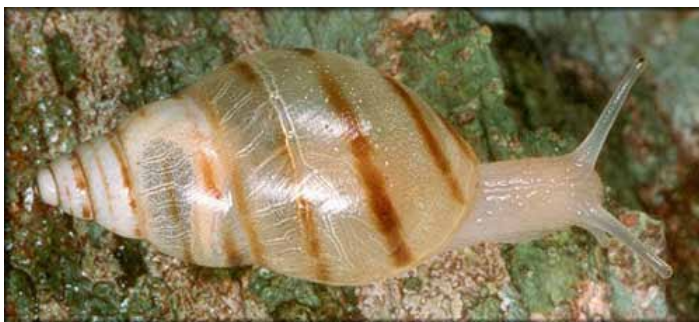
Figure 6. The Master treesnail, Drymaeus dominicus (Reeve 1850).

4 ? . Shell 15 to 25 mm, with 3 to 5 irregular narrow brown bands on the body whorl, lip of aperture not flared . . . . . Master treesnail, Drymaeus dominicus (Reeve 1850). The bands can be unevenly broken or even lacking. This species can be differentiated from D. dormani by the rounder whorls, smaller adult size, and lack of a flared apertural edge. It is found on citrus and native trees in southeastern Florida south of Lake Okeechobee to the Florida Keys and parts of the Caribbean.