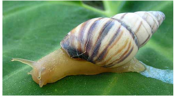
Figure 3. The lined forest snail, Drymaeus multilineatus (Say 1825).

the southern counties of Florida, in the Florida Keys, and in the Caribbean.