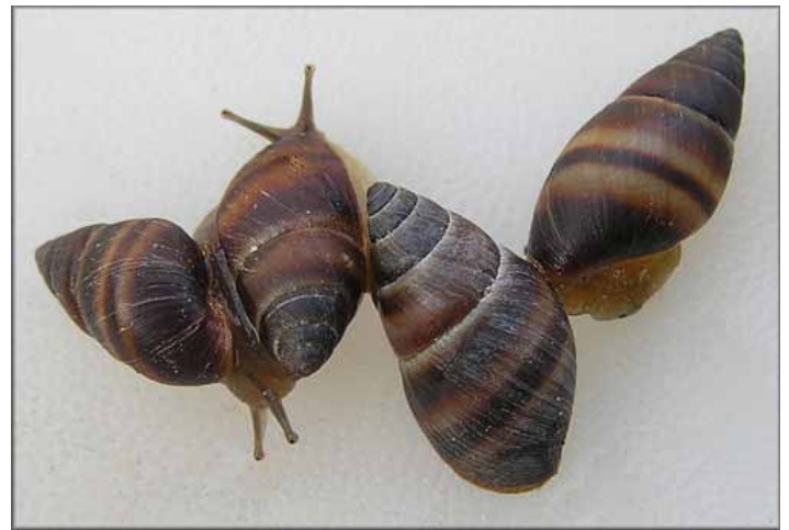
Figure 4. The West Indian Bulimulus, Bulimulus guadalupensis (Bruguière 1789).