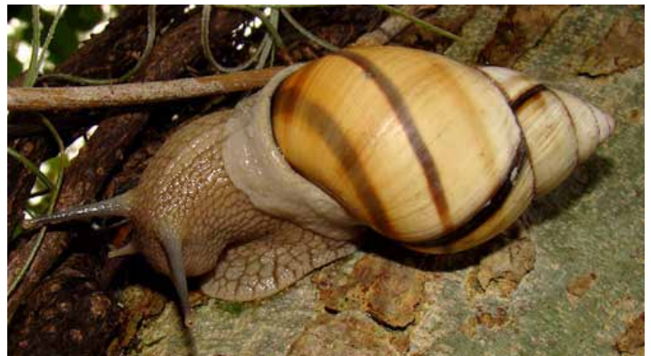
Figure 8. The banded tree snail, Orthalicus floridensis Pilsbry 1891, is the largest Florida tree snail.

6 ? . Shell lacking flame-like stripes . . . . . banded tree snail, Orthalicus floridensis (Pilsbry 1891). This is the largest Florida tree snail, and is tan with two to three spiral brown bands and one to four dark brown vertical growth lines. Both the margin of the aperture and the parietal callus are dark brown. This native species is endemic to South Florida and the Florida Keys on native and introduced trees.