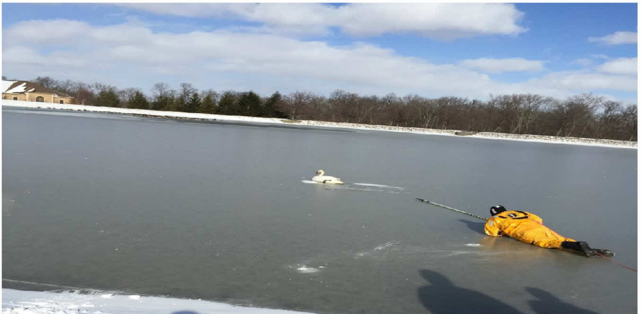
Animal rescue- swan stuck in the ice.