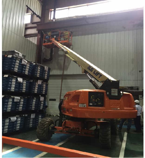
Fire at Timbertech using unconventional ways to get to the fire.