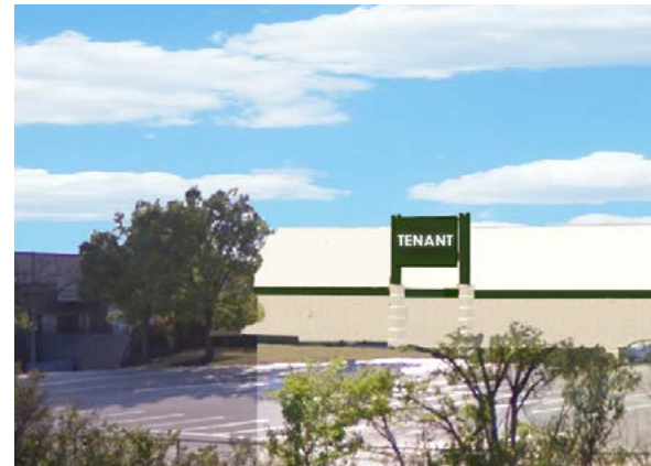
WEST PLAZA ENTRANCE: PROPOSED