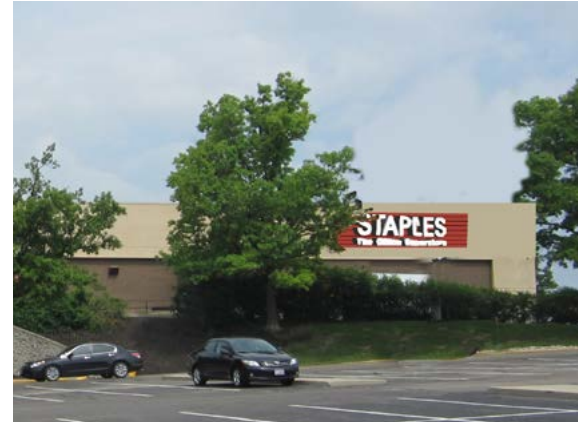
WEST PLAZA ENTRANCE: EXISTING