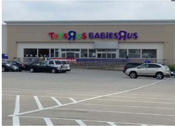
EAST FACADE: EXISTING