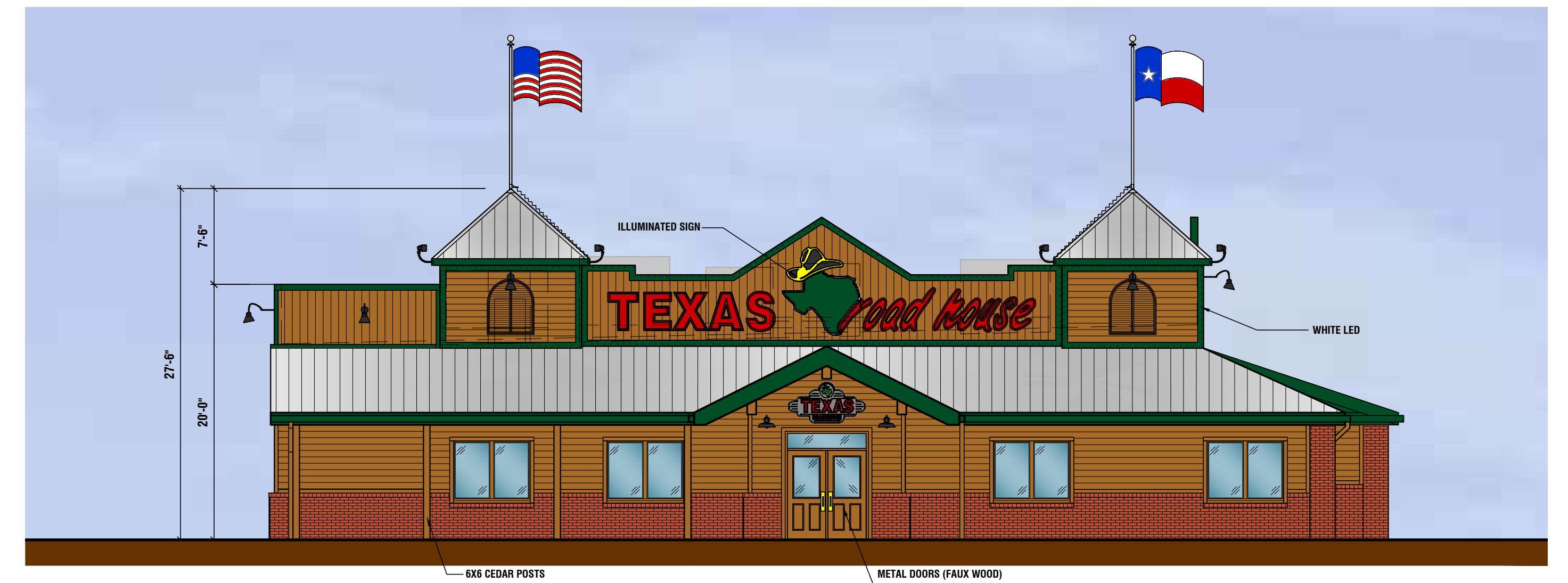
LEFT ELEVATION (SOUTH)