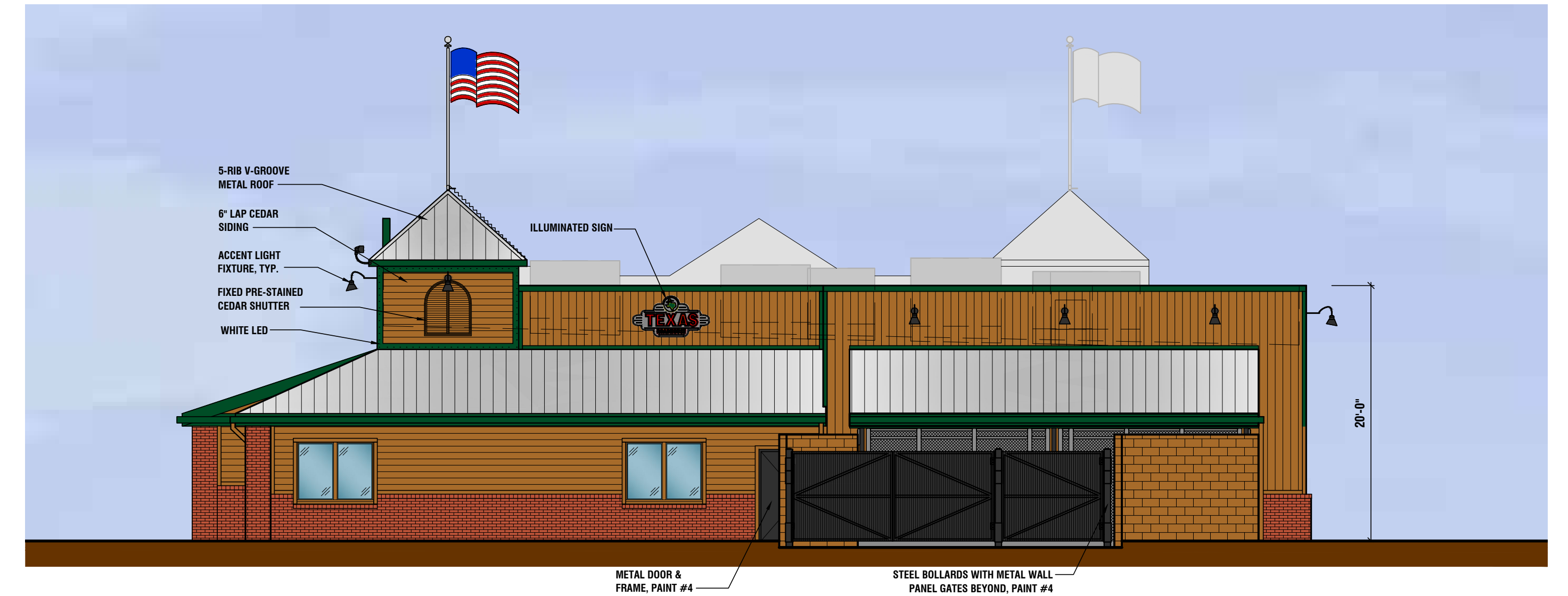
RIGHT ELEVATION (NORTH)