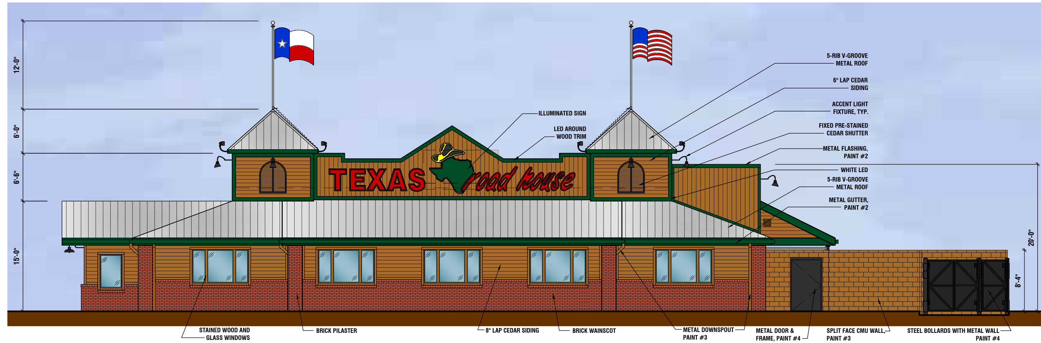
FRONT ELEVATION (EAST)