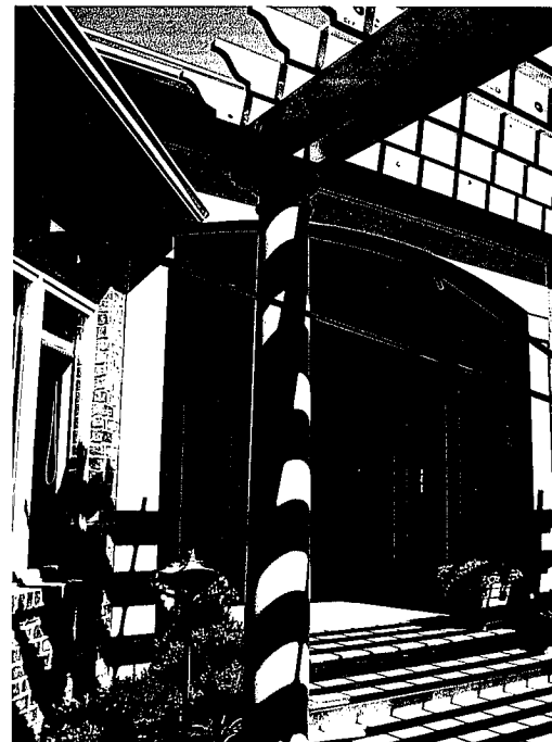
Photo 4 - Arched patio entry - Transom window