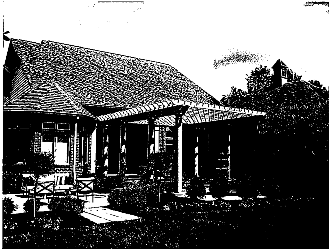
Photo 1 – Pergola located in protected rectangle, multiple rooflines

SYCAMORE TOWNSHIP PLANNING & ZONING JUN 24 2013 RECEIVED