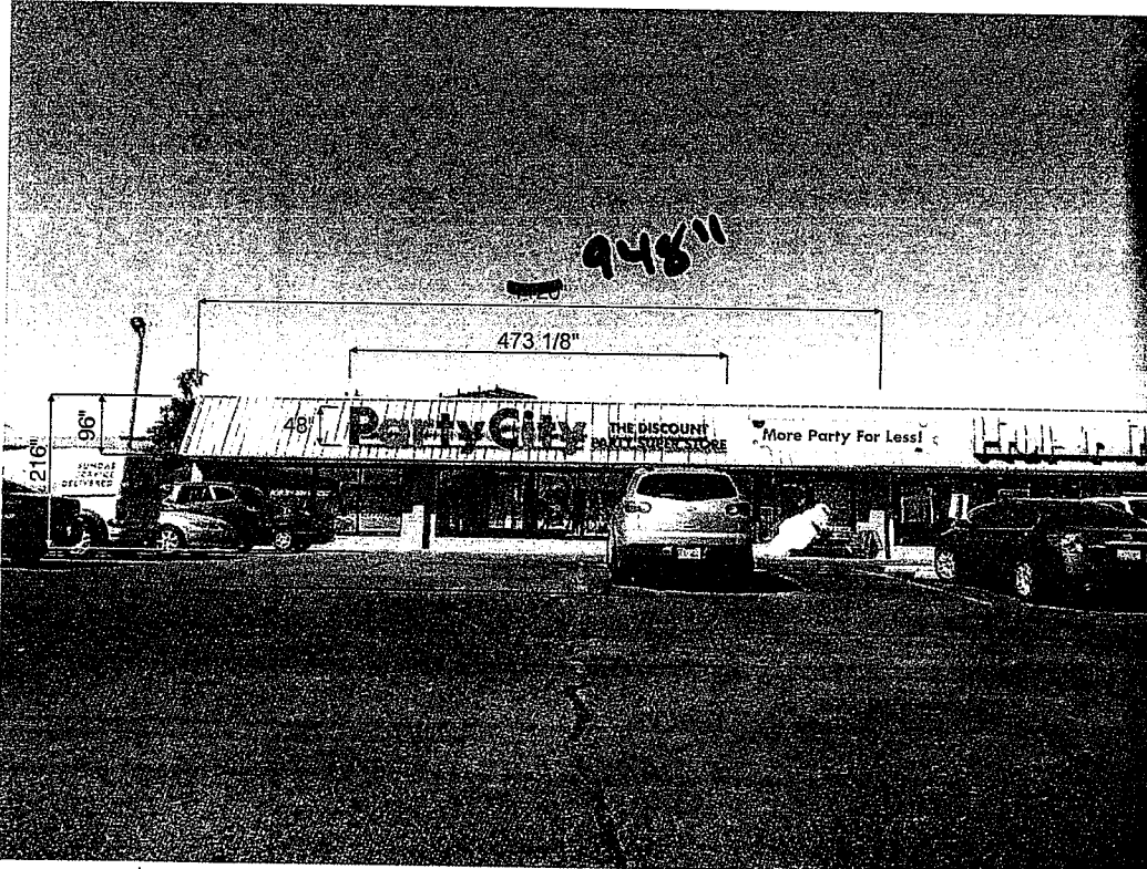
Front Elevation Scale: NTS