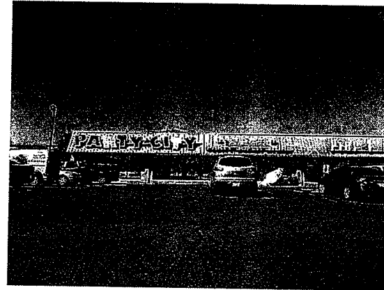
Existing: Approx. 48" x 780" = 260 SF