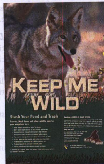
Poster (and other no-feeding campaign information) available from the California Department of Fish and Game at http://www.dfg.ca.gov/keepmewild/coyote.html

Using slogans such as "A fed coyote is a dead coyote," no-feeding programs aim to raise awareness of the negative effects of feeding coyotes.