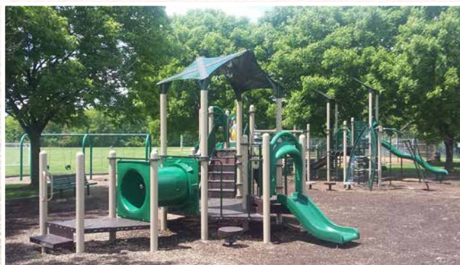
The brand new playground at McDaniel Park is now finished and ready for play! Come check it out with the kids this summer!