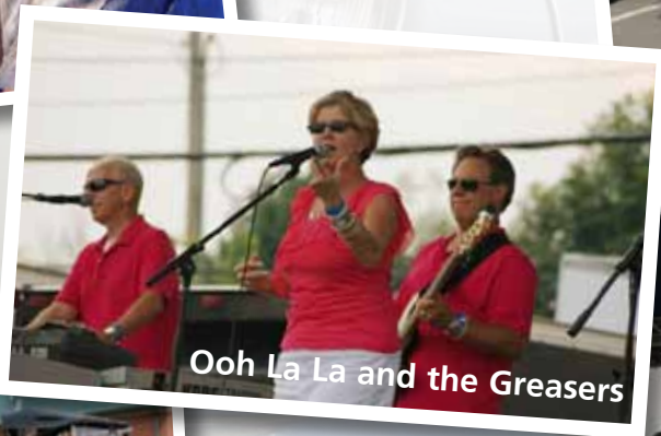
Ooh La La and the Greasers