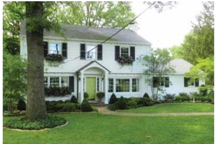
Concord Hills Place