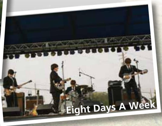
Eight Days A Week