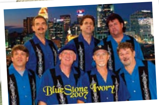
Blue Stone Ivory