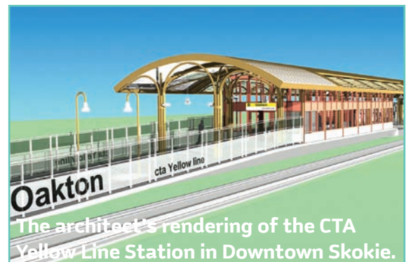
The architect's rendering of the CTA Yellow Line Station in Downtown Skokie.