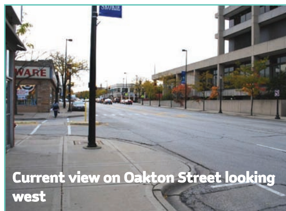
Current view on Oakton Street looking west

The Village recognizes that the “Road Diet” stands to have a significant impact on the community, and it would require considerable resources for full imple-