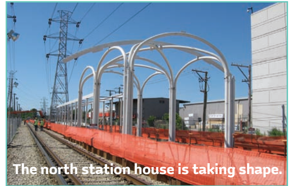
The north station house is taking shape.