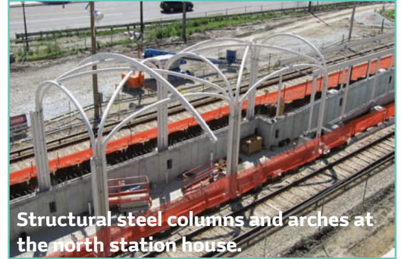
Structural steel columns and arches at the north station house.

A $14 million Congestion Mitigation and Air Quality (CMAQ) grant will fund approximately 70% of project costs. The anticipated opening of the station is January 2012 and it will be a welcomed addition to Downtown Skokie. Monthly updates on the progress of station construction can be found on the Village of Skokie website, www.skokie.org . Please contact the Village Engineering Division at 847/933-8232 with any questions or comments.