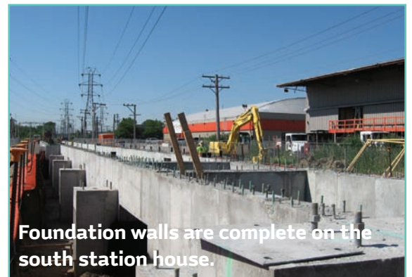
Foundation walls are complete on the south station house.