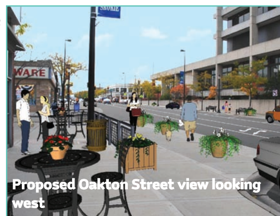
Proposed Oakton Street view looking west

mentation. Due to the cost and importance of the proposed project, the Village conducted a six-week test of the Oakton Street “Road Diet” in May and June, 2011. The test included using striping and traffic barrels to narrow Oakton Street to one wider lane in each direction, and one center turn lane from Long to LaCrosse Avenues. An additional 30 on-street parking spaces were added on Oakton