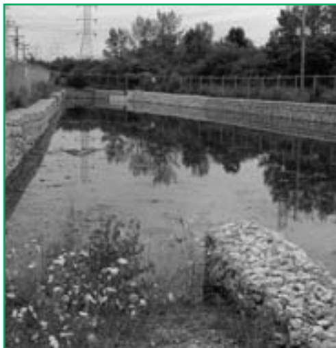
Shown above: Gabion Pond on Oakton Street in Downtown Skokie. Depressed landscaped areas like Gabion Pond are used to detain stormwater runoff during heavy rainstorms. The ponds fill with excess water and drain into the combined sewer system at a rate that reduces the chance of sewer surcharge.

During the weekend of September 13 and 14, Skokie received over eight inches of rain which resulted in many street closures and localized flooding. As a result, the Village would like to communicate the following: