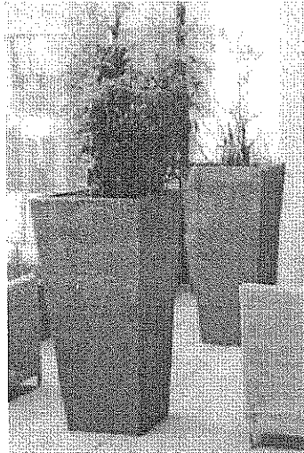
Square Urban Planter Pot