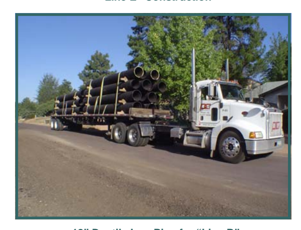
18" Ductile Iron Pipe for "Line B"