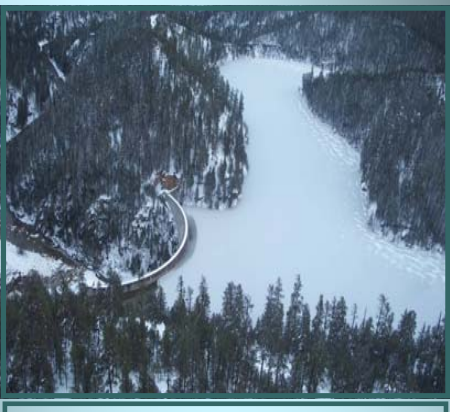
C.C. Cragin Reservoir, Winter 2008

Completion of the project is planned between the year of 2017 and 2020. Within this time frame, a renewable surface water supply will become an integral and essential part of Payson's water resources portfolio.