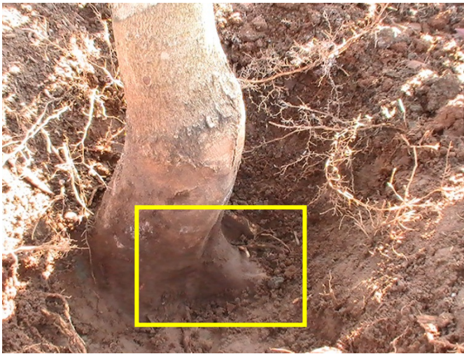
Root flare below grade