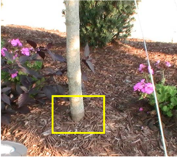
Planted too deep – “telephone pole”

The root flare has curvature on several sides around the base. The graft union only curves out in one place.