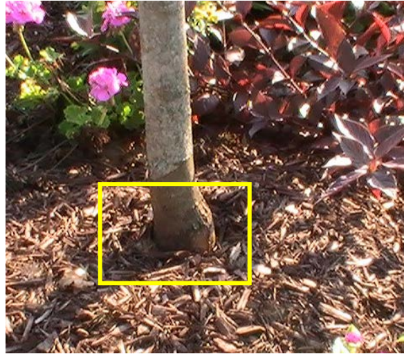
Planted at level of graft union