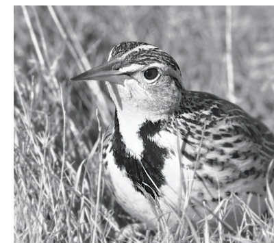
Western Meadowlarks winter in the central grasslands at Bedwell Bayfront.