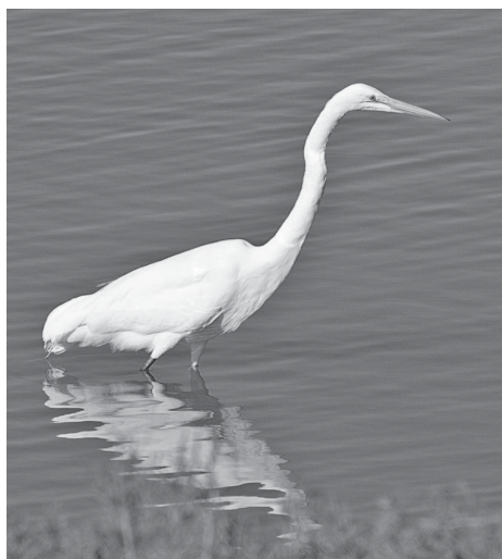
Bedwell Bayfront is home to some 160 species of birds, including this Great Egret.