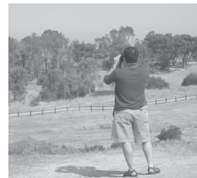
The park's hills are popular with birdwatchers, hikers, dog walkers and bicyclists.