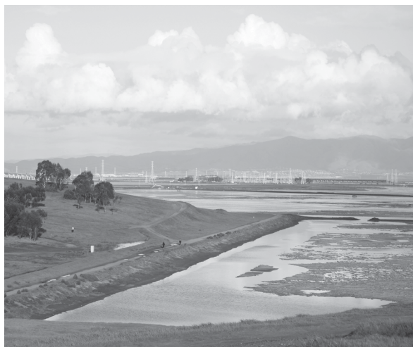
The park is surrounded on three sides by the Don Edwards San Francisco Bay National Wildlife Refuge.