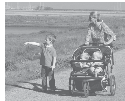
Visitors of all ages enjoy the park.