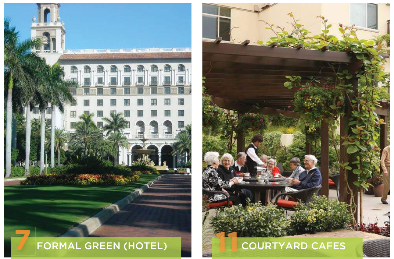
7 FORMAL GREEN (HOTEL)