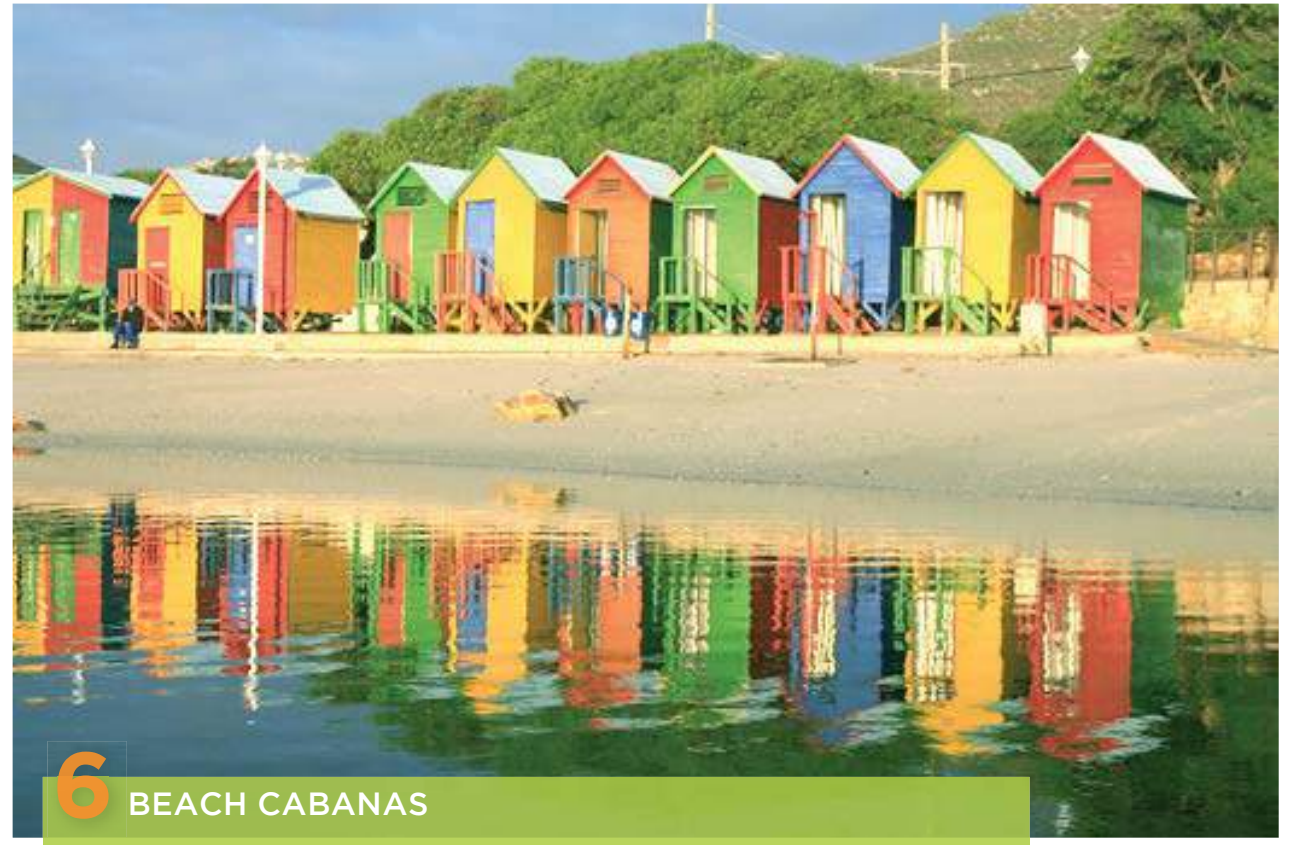
6 BEACH CABANAS