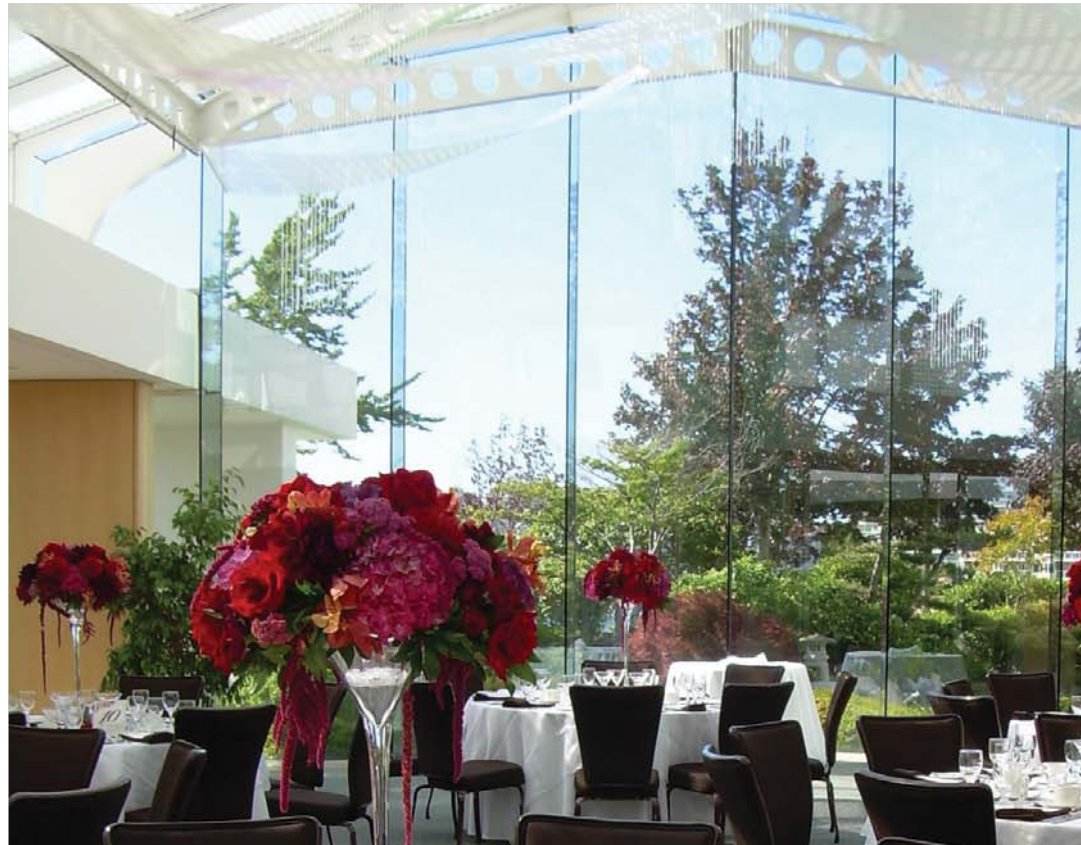
17 MULTI-PURPOSE BUILDING