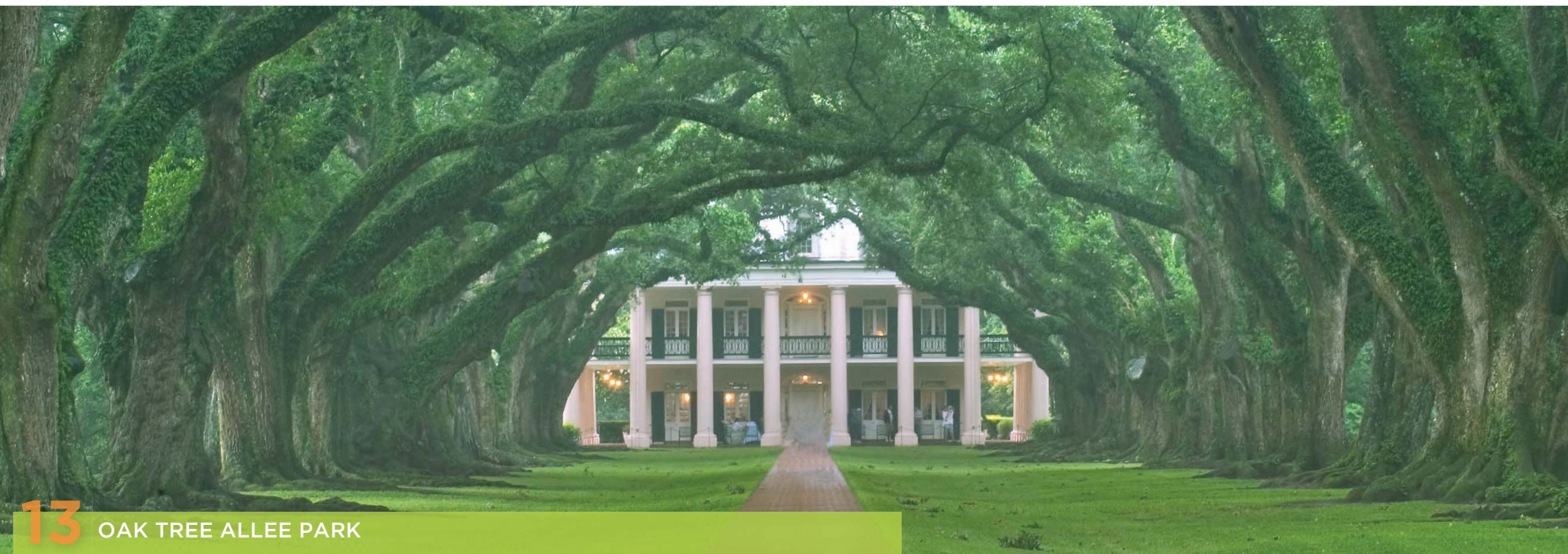
13 OAK TREE ALLEE PARK