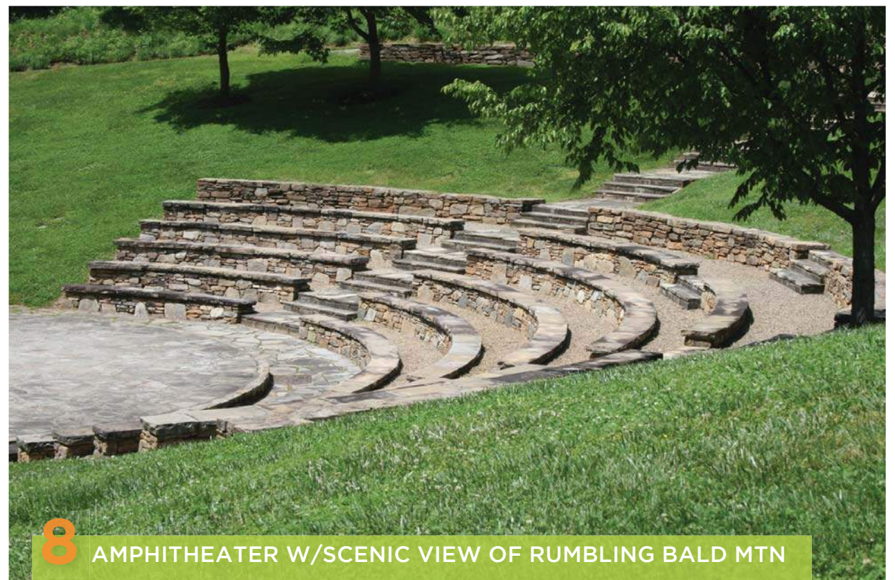
8 AMPHITHEATER W/SCENIC VIEW OF RUMBLING BALD MTN