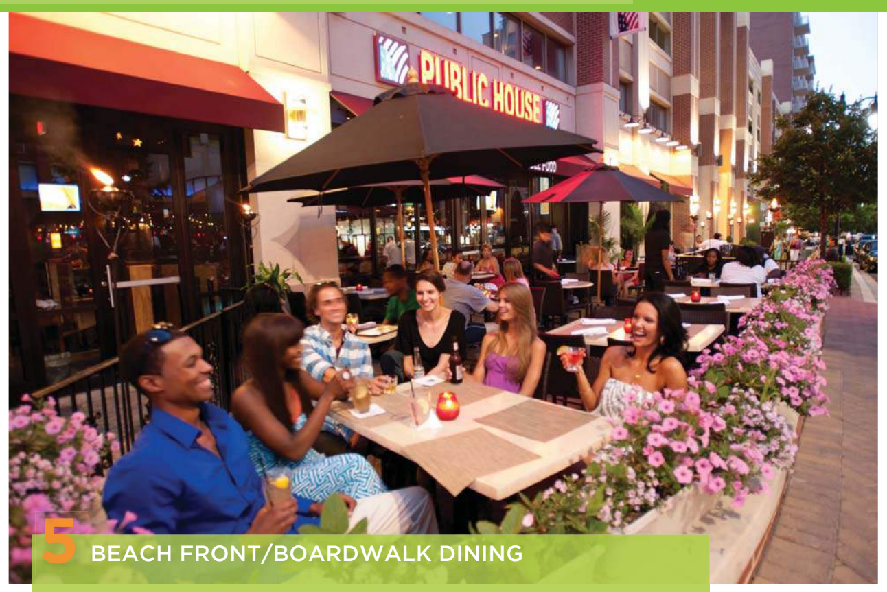
5 BEACH FRONT/BOARDWALK DINING