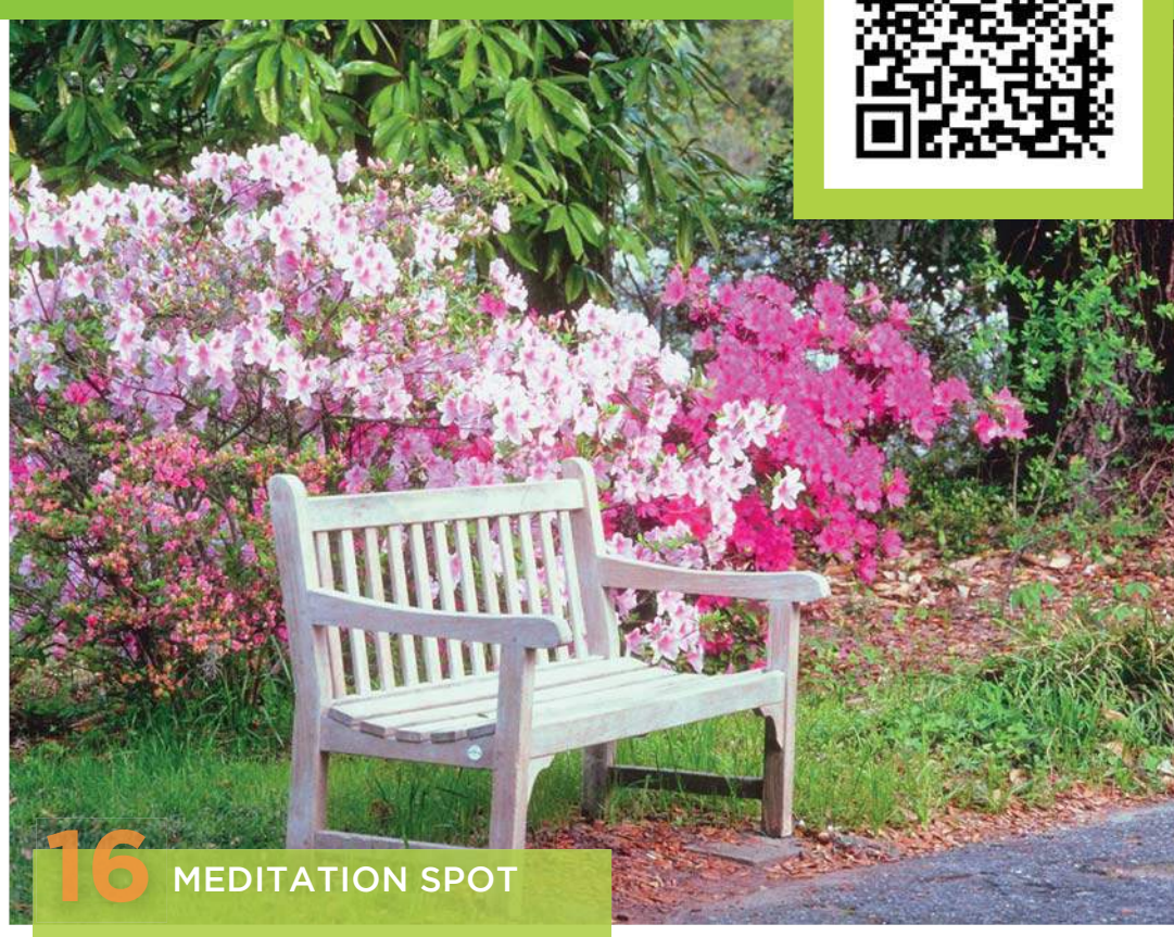
16 MEDITATION SPOT