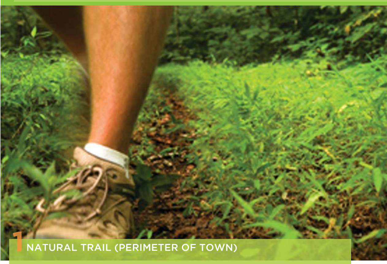
1 NATURAL TRAIL (PERIMETER OF TOWN)