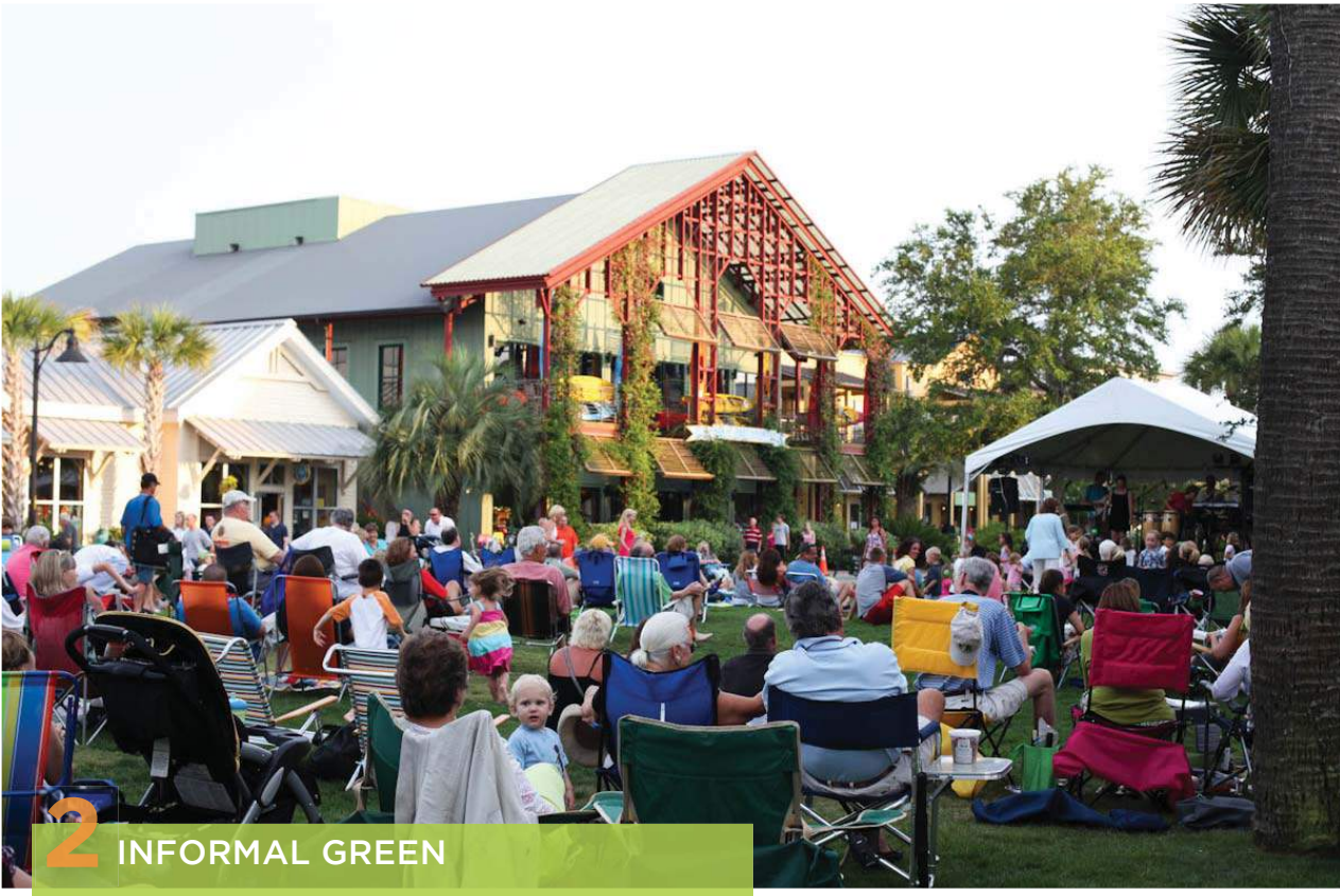
2 INFORMAL GREEN