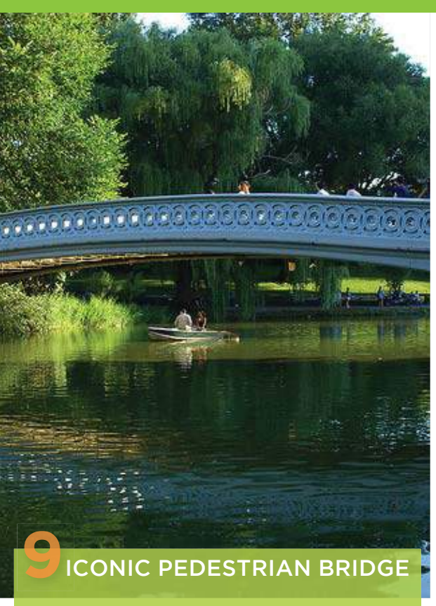
9 ICONIC PEDESTRIAN BRIDGE