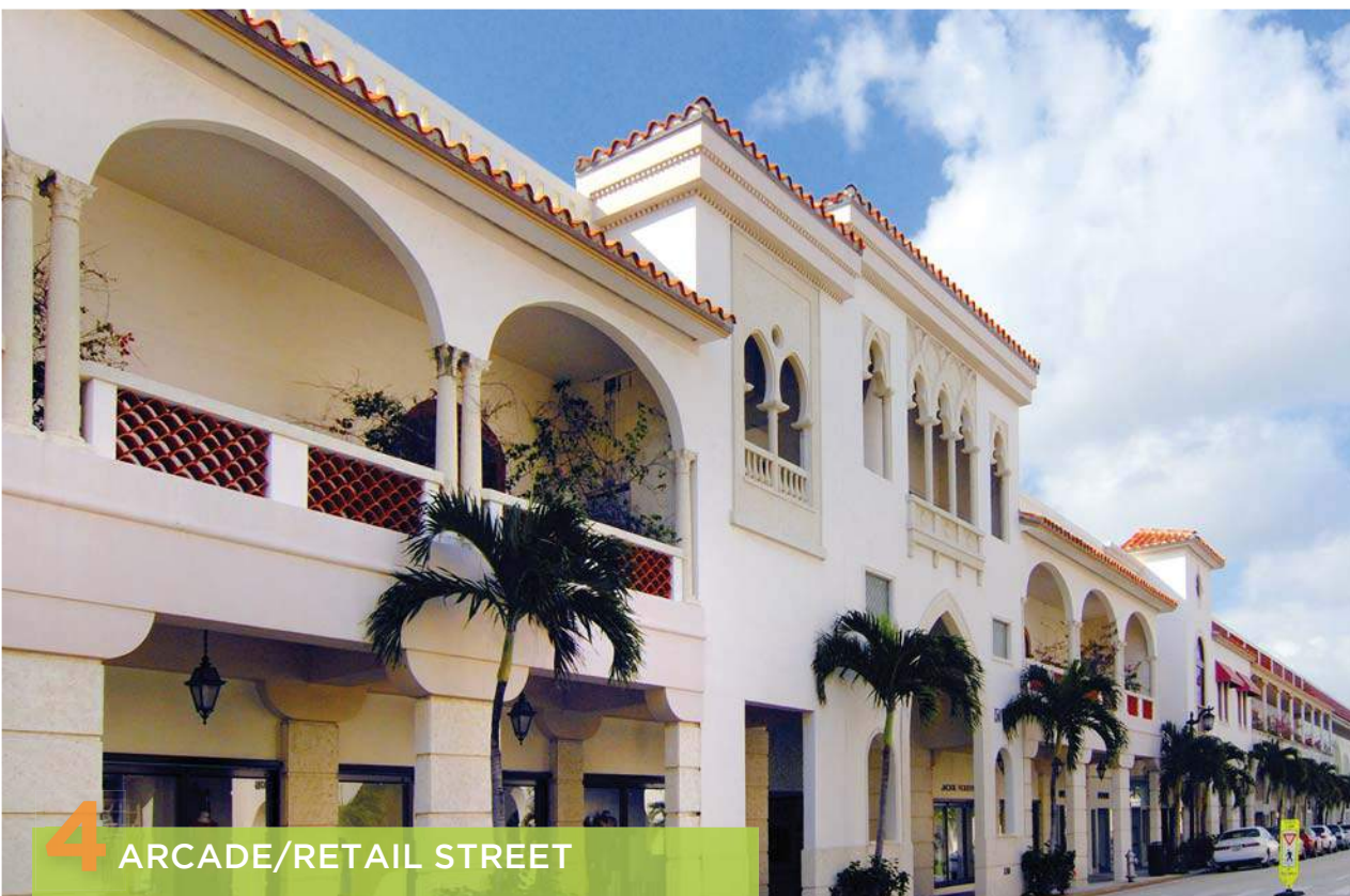
4 ARCADE/RETAIL STREET