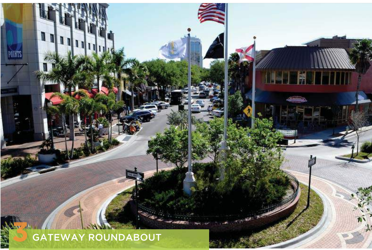
3 GATEWAY ROUNDABOUT