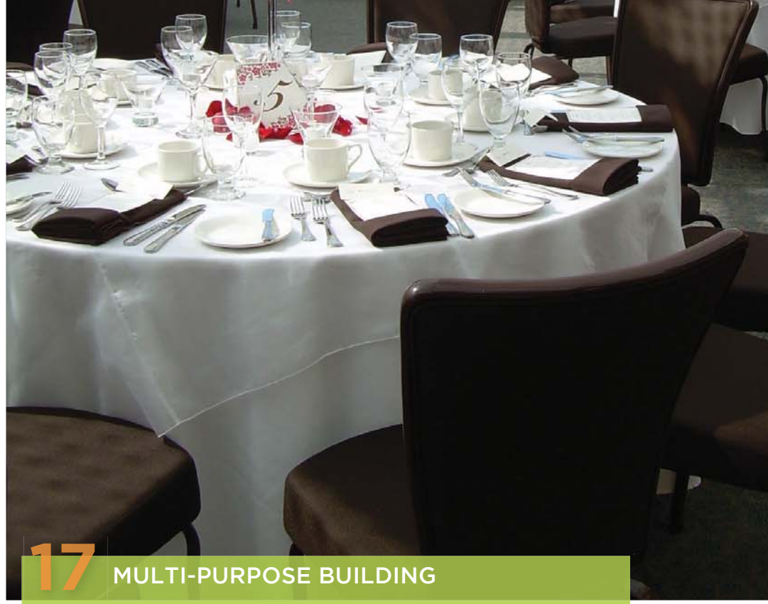
12 WATERVIEW DINING