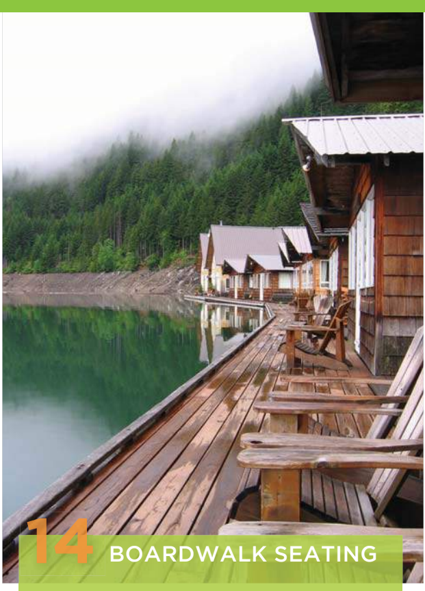
14 BOARDWALK SEATING