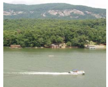
Prevent Crowding Beyond a Safe Density

2 Boating operator training/licensing may limit the number of boats on the lake by virtue of need for trained operator at all times. Although there is no limit on how many operators become trained, this may limit access by transient potential boaters, allowing more permits to be offered with no increase in actual boat density, on average.