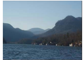
Lake Lure topography.