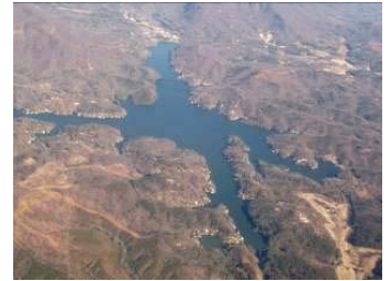
Lake Lure from the air.

Recreational facilities on the lake consist of a Town Beach complex, with swimming area, park and boat launch, as well as an accompanying marina. Most land around the lake is privately held. There are a number of additional beaches and several boat ramps, as well as private community marinas. The majority of boating activity comes from shorefront residences. Many lakefront homes have multiple boats and there are over 300 boat slips associated with private developments that abut the lake. Off-lake residents and even residents of other towns can purchase boat permits for Lake Lure.