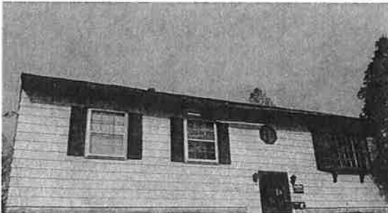
Animal intrusion at soffit in front of home (SEP, 12/17/12)

On December 6, 2012, I observed an accumulation of waste and garbage inside the home. Additionally, the home was not secured against the entry of animals, the home did not have utilities, there was mold observed in the basement, and the back steps were unsafe and did not provide a safe means of egress in the event of an emergency. In addition, the following photographs were taken during the inspection(s):