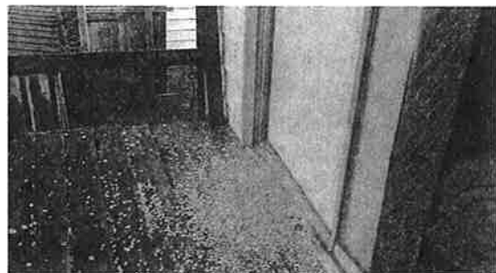
Back door being "secured" with a box spring (SEP, 12/17/12)