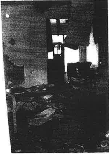
5/5/12 Observed entry points, garbage/food debris, water leak from roof and mold. ATB