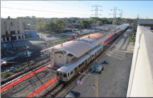
Architectural roofing installation at the North Station House

The Village of Skokie and project partners are pleased with the progress thus far and hope these monthly updates are informative. Please contact the Village with any questions or comments.