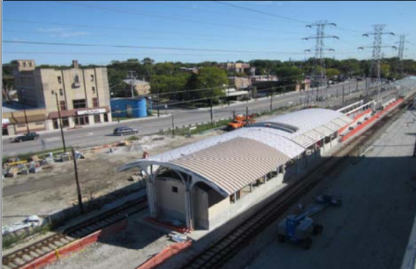
Architectural roofing and waterproofing at the North Station House