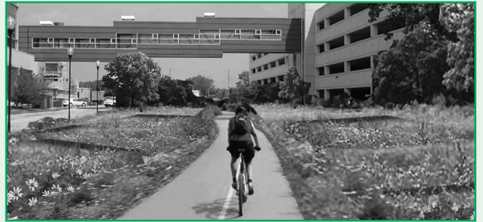
Skokie Rails to Trails Corridor through the Illinois Science + Technology Center

The conceptual plan calls for a variety of park themes or "Rooms" in different segments of the path. For example, the area between Oakton Street and Searle Parkway is designed as an open prairie field. The area between Searle Parkway and Main Street will continue the prairie look, but also will feature a row of columnar trees to accentuate the narrow area. A sculpture display area is incorporated into the triangular area at Main