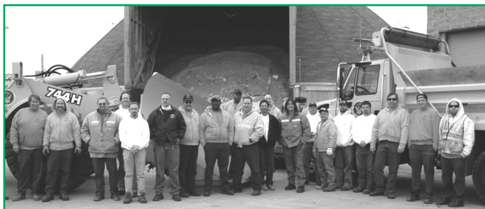
The 2011 Streets and Alleys Snow Crew

To reduce the amount of snow that plows deposit on the driveway apron, pile snow to the left side of the driveway when facing the house or garage when shoveling.