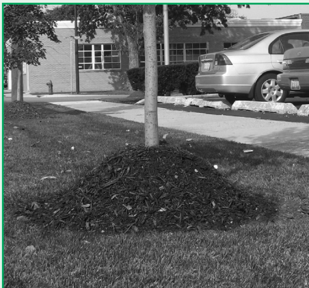
Improper "Volcano" Mulching

For more information, please visit the following websites at www.mortonarb.org or www.treesaregood.com , and follow the links for "Tree Care". ∞