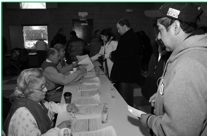
Shown above: Patrons complete paperwork in anticipation for their H1N1 vaccination.

More than 1,100 volunteers, including 232 medical volunteer vaccinators, assisted during the entire campaign. Many of the volunteers also serve on one of the Village's volunteer boards and commissions.