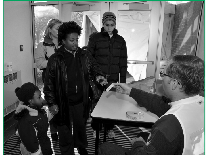
Shown above: Patrons of one of Skokie's four H1N1 Influenza Vaccination Clinic check-in to begin the process of receiving their vaccination.