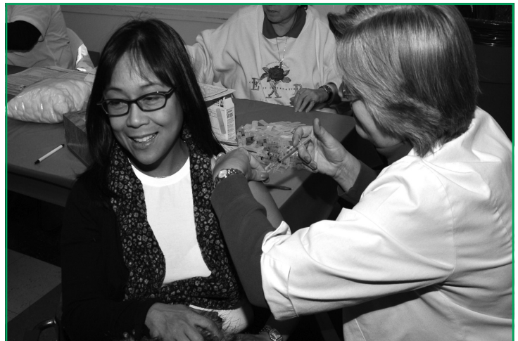
Shown above: A patron receives her H1N1 vaccination.

The Village has received numerous expressions of appreciation from clinic participants thanking Skokie for its efforts to distribute vaccine to those vulnerable to contracting H1N1 flu.