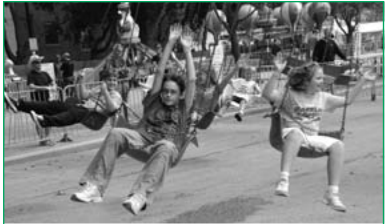
Shown above: Carnival ride at the 2009 Backlot Bash

A number of outdoor sculptures are in place in Downtown Skokie. Several years ago, the Village established a Public Arts Advisory Committee and established a fund to procure public art for Downtown Skokie. In the past year, two sculptures were added to the Village Green between Village Hall and the Skokie Public Library.