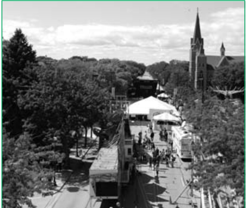
The Backlot Bash was held on August 28 to 30, 2009 in Downtown Skokie.