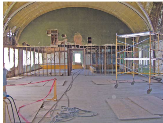
Work Coming Along in Ballroom/Banquet Facility.

Furthermore, the exterior work on the building has been finished. Over 1,300 of the more than 800,000 bricks have been replaced on the Hotel.