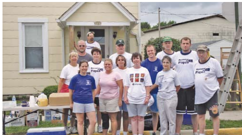
Volunteer Group - City Employees & City Commissioners Paint

help improve the appearance of a neighborhood and also team build with your group.