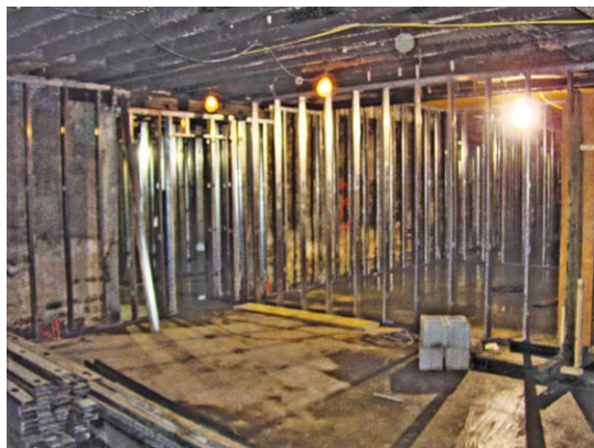
Work Progressing - Administration Office, Library in Basement