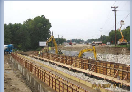
Pouring concrete for Pier Cap - Part of Bridge Replacement Over Rush Creek.