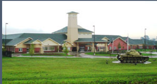
Future Site of Veterans' Memorial Project Eastern Nebraska Veterans' Home 12505 40th Street Bellevue, NE 68123

To send a donation through PayPal, please send money to cakucirek@paypal.com or go to the Papillion Fire Department's website at: http://www.papillion.org/fire_leadership_sarpy.cfm and click on the "PayPal Donate" button. If you would like to mail a check or money order for your donation, please complete this form and mail to the address on the reverse side. Please make your check out to Leadership Sarpy Veterans' Memorial Project. Your Donation is Tax Deductible.