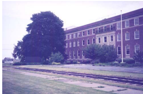
Personnel reductions and the closure of large-scale industrial operations have led to unemployment levels that exceed state and national averages.

The following is a brief discussion of the challenges the city currently faces. Many of these challenges represent impacts of 40 years of industrial and manufacturing decline, and poor investment decisions, that have adversely affected the city, its growth and economy. The impacts of this decline reinforce the need for creative diversification of the city's employment and economic bases to sustain a vibrant residential population.