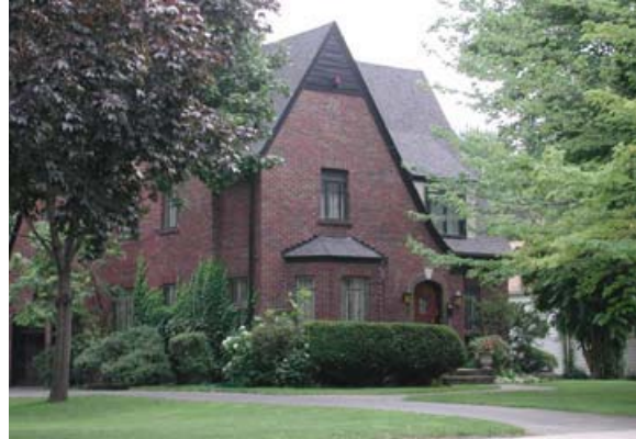
The decline of the housing market and residential neighborhoods must be halted by protecting stable residential areas and...

The growth of Niagara Falls and its neighborhoods occurred largely in response to the city's pre-war economic and industrial expansion. As a result, many working class neighborhoods developed quickly and were located immediately adjacent to existing or former industrial areas and the infrastructure serving them, such as train tracks. While this provided quick access to employment areas, many neighborhoods were not sufficiently buffered from heavy industry or became surrounded by industrial uses over time and isolated from neighboring residential areas. This situation