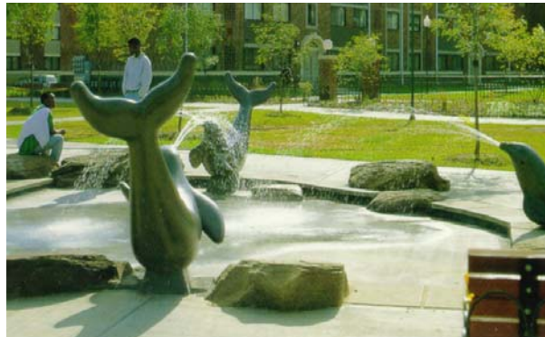
The Cultural District will be a destination of regional significance, offering a range of active and passive spaces and new high quality educational and tourism developments.

This district is envisioned as a remarkable destination landscape set on the plateau above the Niagara Gorge that will contain a range of high-quality, family-oriented educational and cultural venues and attractions that will dramatically strengthen the tourism offering of the Core City while complementing the State Park lands along the Gorge.