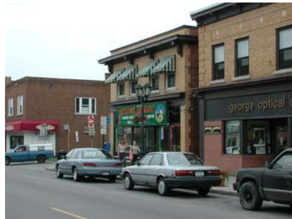
Pine Avenue is a healthy commercial corridor linking neighborhoods and people to the city's waterfront.

Many businesses along the Main Street, Pine Avenue, Niagara Street and Third Street corridors and other areas of downtown have been in operation for generations and are well-established local gathering places. Communities throughout North America have realized the potential of these corridors and places, and are investing in them as authentic places that offer a glimpse of historical development and an understanding of local culture and everyday city life. Niagara Falls' commercial nodes and corridors are assets that must be built upon, to improve the overall economic performance and quality of life found within the City. Linking existing commercial corridors firmly to tourism development and elevating the role of these corridors as primary linkages between local attractions and major tourism destinations, will enable these corridors to play a key role in the renewal of the city. Strategies and initiatives that can help elevate and reinforce these corridors as primary linkages between tourism precincts include streetscape improvement programs, unique retail and niche marketing campaigns and other economic and development programs.