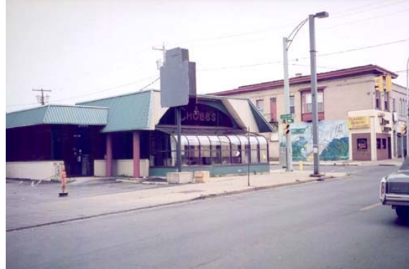
Suburban style growth has had a significant and negative impact on the city's commercial corridors.