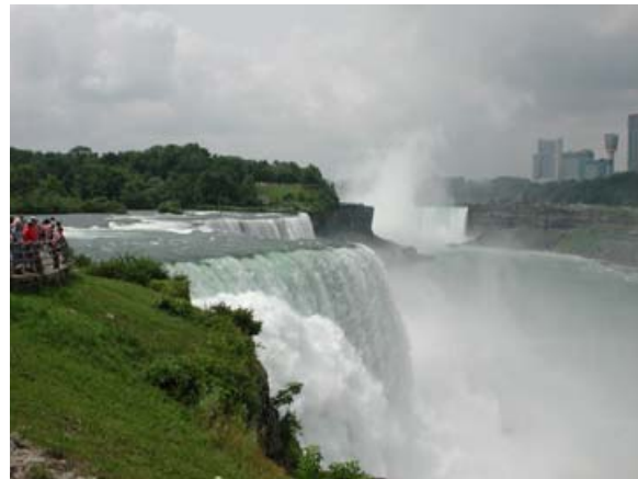
The Falls and the Olmsted Park system are primary assets which are disconnected from the Core City by the Robert Moses Parkway.

With its unique combination of assets and attractions, Niagara Falls can become the fulcrum for tourism in Western New York, focusing and strengthening the regional tourism base. As the focus for tourism in Niagara Falls, the historic downtown core must be improved to meet its potential and anchor the city's economy. A more strategic approach to development and positioning of attractions is needed to give Niagara Falls a strong and genuine identity within the region, as a beautiful place to visit as well as a vibrant place to live.