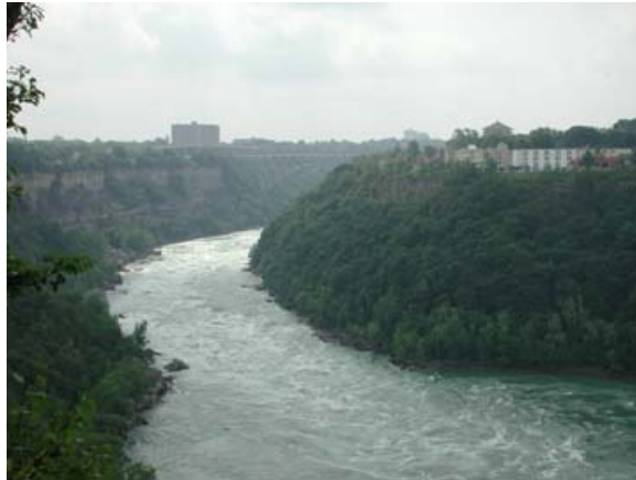
Niagara Falls is uniquely positioned within the Bi-national Region. It must leverage its assets to promote more cross-border tourism and shopping.

recognizing the importance of cross-border commerce and collaboration. Through cross-border collaboration between agencies the City can better position its unique natural and economic assets and benefit from its bi-national geographic circumstance.