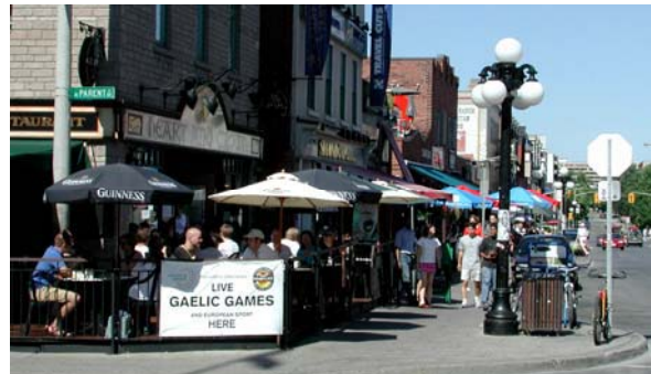
Pine Avenue will be a destination for both residents and visitors.