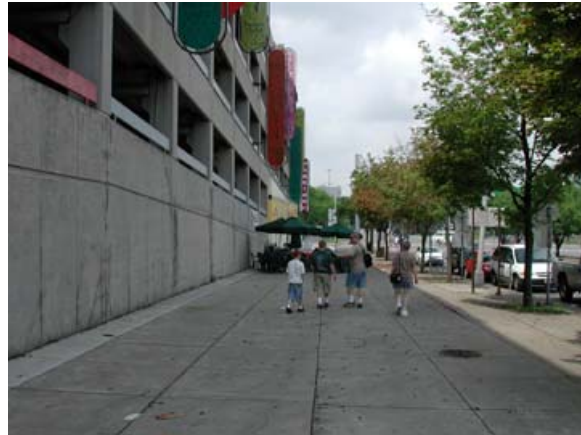
The physical quality of the city is a deterrent to tourists.

Over the past four decades, the City of Niagara Falls has suffered from economic and industrial decline, and serious employment and population loss. As well, a number of misguided renewal initiatives that removed residential and commercial stock in the heart of the city have fragmented the downtown core and the communities that traditionally supported it. Today, many urban neighborhoods are in decay, large areas of the city's industrial corridors are abandoned, and many residents, community and business leaders have lost their sense of pride in their city. In fact, many former residents have chosen to move out of Niagara Falls. Many visitors are disappointed and clearly unimpressed by the quality of the urban environment and the tourism offering that is not what they would expect adjacent to a world-class natural heritage destination such as the Falls. Tourists prefer to visit Niagara Falls, Ontario than remain in Niagara Falls, New York for more than a couple of hours.