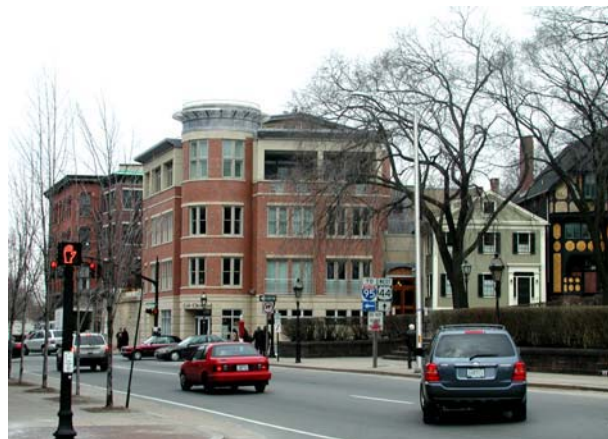
New development in the [Wright Park] Park Place Heritage District will complement the historic character of the precinct.

The Comprehensive Plan recommends the designation of this district as a unique heritage district with a special role in the overall tourism offering, as recommended in Section 4.1.6. The area would retain its predominant residential use, enjoying a new relationship to the waterfront achieved through the reconfiguration of the Robert Moses Parkway. The district would benefit from small-scale tourism oriented uses, including boutique hotels, restaurants, galleries and other amenities to be encouraged on Third Street, and from heritage themed streetscaping focused on the portion of Pine Avenue