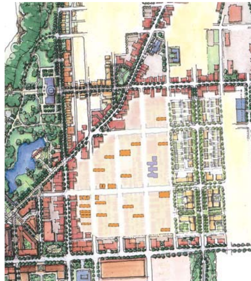
The orange areas represent the concept of targeted acquisition of code deficient and derelict units negatively impacting the overall neighborhood.

The release of properties for development will be at the discretion of the management agency established to oversee Land Bank acquisitions and dispositions, such as the Urban Renewal Agency. Large properties with significant development potential within the Core City