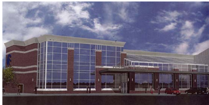
The high quality of the Memorial Medical Center expansion should be met with an appropriate municipal response including high quality streetscape improvements, to encourage residential reinvestment and renewal around this important regional amenity.