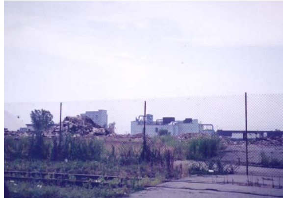
The steady decline of heavy industry has resulted in economic and social dislocation.

All urban places undergo a continuous process of change, evolution, growth and decline. Successful communities are able to understand and mediate their unique challenges and build on opportunities to improve their overall circumstances, quality of life, economic vitality and livability. To be successful, positive change must be based on a realistic understanding of contemporary challenges, opportunities and economic drivers that must be addressed and/or leveraged to improve the city's quality of life and potential for the future.