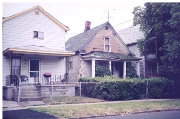
... introducing programs for renewal and repair.

Oversupply of this older residential stock and a continuing decrease in family size, together with population out-migration have meant that the overall housing market is low. Resale values in the Core City are extremely weak, where one would typically expect to find the most desirable and upscale housing, given proximity to the core and the extent of original or heritage housing stock.