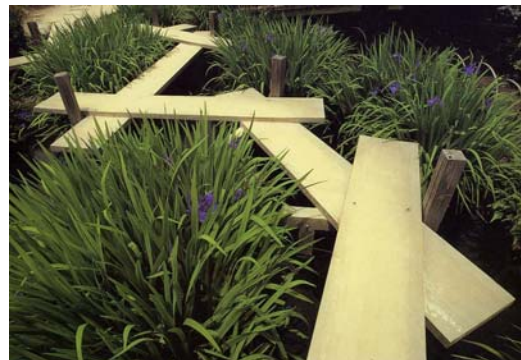
The Cultural District will be the ideal setting and location for demonstration projects related to environmental management.

A destination in its own right, the District would act as the ‘container’ for a collection of attractions celebrating the unique industrial, cultural, natural and geological history of Niagara Falls and the region, as well as offer other tourism-related developments. The collection would include the expanded or rebuilt Niagara Aquarium adjacent to the new Niagara Gorge Discovery Center located in the State park. This may also be an ideal location for the proposed Niagara Experience Center. A state-of-the-art, outdoor, performance and concert venue with regularly scheduled events should be included to take advantage of this unique location and landscape setting, and add a valuable cultural draw to augment other Niagara Falls attractions. A pavilion-style hotel, fronting on all sides so as to be seen ‘in the round’, could provide a focus for retail, restaurants and other tourism offerings within the Cultural District. A man-made lake or other water feature at the heart of the district could be used to demonstrate best practices in stormwater management, building upon the eco-tourism potential of the Niagara River corridor. The Gorge View section of