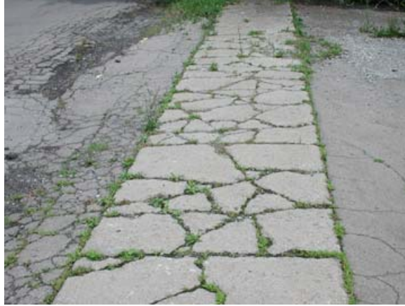
The city’s infrastructure is crumbling as a result of a steadily declining tax base.

Yet, the unrealized opportunity is for additional and upscale lodging development and for expanding the existing ‘tourism program’ and recreational offerings. It is the city’s latent ability to expand its offerings with new attractions, quality lodgings, restaurants, boutique shopping, entertainment, family and educational destinations and other amenities, and, at the same time, improve the visual or physical quality of the urban environment, which has the greatest potential to yield positive economic growth for Niagara Falls and encourage new growth in other sectors.