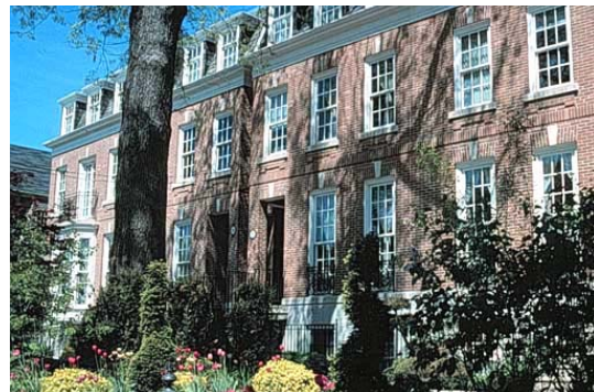
Townhouses and low-rise apartment buildings with generous front yard landscaping will support the creation of a unique character along the John B. Daly extension.