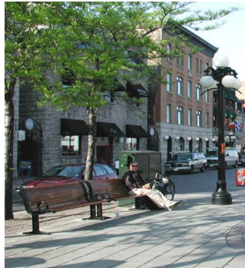
The conversion and reuse of historic buildings will reinforce North Main Street as a special place.

Current and continued residential loft conversions, and the adaptive reuse of existing heritage building stock with new retail and service uses attractive to both the local population and university students would help to restore this portion of Main Street as a healthy commercial corridor. To support and fuel this type of positive reinvestment, a streetscape improvement program should be initiated throughout this precinct, generally consistent with the recommendations of the Main Street Revitalization Study (2002). Streetscape improvements along North Main Street, including tree planting and