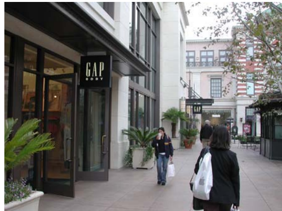
The presence of nationally recognized retailing as well as local businesses will strengthen Niagara Street as a distinct shopping precinct within the city and region.

An integrated Master Plan Study is necessary to plan and understand the potential and feasibility of a compact mid-to-highrise urban retail and residential environment on the Niagara Street Corridor, a spine effectively linking the Casino Precinct (see Section 4.2.6), the Falls Precinct (see Section 4.1.3), the Cultural District (see Section 4.1.2) and the riverfront. The goal is to create a new high value urban mixed-use, entertainment and shopping precinct. This study must include expertise in urban design, retail and merchandizing, transportation and streetscape design, market and economic analysis, and development financing to fully address the complexities involved in mixed-use urban redevelopment.