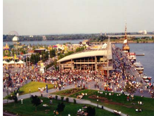
Festivals are an excellent way to celebrate achievements, inaugurate new projects, attract tourists and create a sense of pride in the city.

Celebrating public sector projects, which are often funded through taxes, will help to emphasize the City's involvement, leadership and commitment to renewal activities.