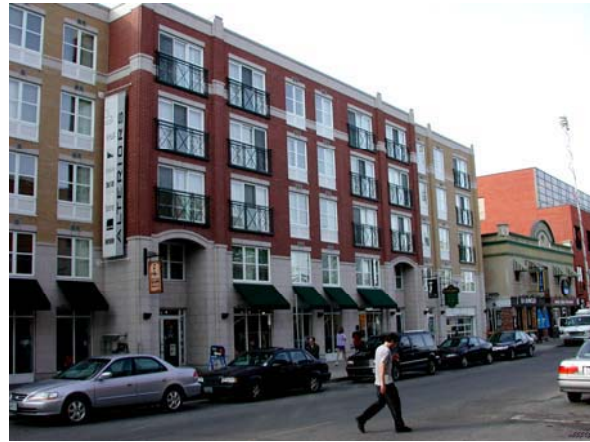
A greater emphasis on upper-storey residential uses will add new vitality to Pine Avenue.

The recent conversion of the old Niagara Falls High School to accommodate the NACC is a