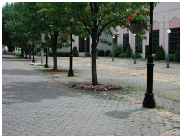
USA Niagara is leading efforts to improve and revitalize Old Falls Street as a key pedestrian connection and gathering place. The Strategic Master Plan must build on key current initiatives.

The State of New York established USA Niagara in 2001 to support and promote economic development initiatives in Niagara Falls, and both are intent on leveraging private investment and encouraging growth and renewal of the tourism industry. USA Niagara is currently involved in a number of significant projects. These include bringing high-quality urban residential opportunities to the downtown through the conversion of the United Office Building to residential uses, the redevelopment of the Falls Street Faire to establish the city's new conference/convention center, and most recently, the Third Street streetscape proposal. The agency is also supporting local efforts to establish the Niagara Experience Center, aimed at enhancing the city's tourism offering with a high-quality educational and heritage attraction.