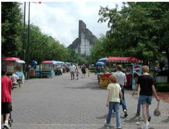
The tourism offering must mature to meet the requirements of an increasingly sophisticated market.

opportunities, making Niagara Falls a more attractive place to live or grow a business, elevating the quality of life, pride and opportunity offered by the city. By placing a strong emphasis on the quality of the total urban experience, this strategy supports tourism within the local community, including all of its assets – main streets, parks, heritage neighborhoods