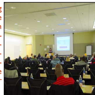
Pictured above past Entrepreneurial Training Program