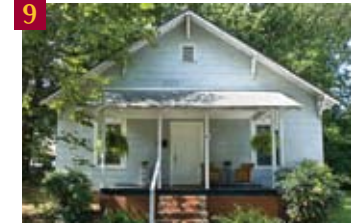
9 The Mooresville Mill Village (ca. 1923) 328 Messick Street See how a mere 900 sq. ft. can easily (and cleverly) accommodate a family of four.