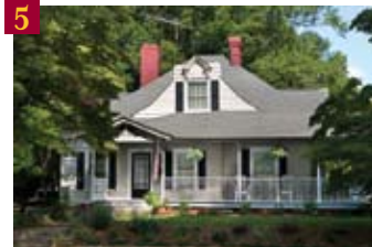
5 The Annie Rankin Carr House (ca. 1902) 329 South Academy Street See how extensive restoration efforts have revived this Queen Anne style cottage.