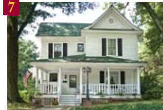
7 The Davidson Family House (ca. 1904) 318 West Wilson Avenue Kept in the family, this home has remained virtually unchanged over the past century.