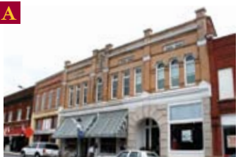
A The First National Bank Building (ca. 1902) 107 North Main Street Developer Zande Homes shows how a creative renovation can revive a space.