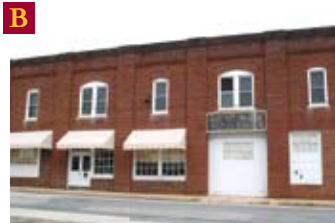
B The Mooresville Museum (ca. 1927) 132 East Center Avenue See a special exhibit here showcasing five historic Mooresville neighborhoods.