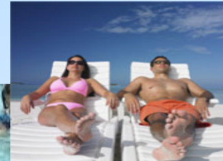
Relax and unwind