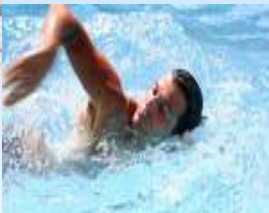
Exercise or just cool off

PRESORTED STANDARD MAIL U.S. Postage PAID Cincinnati, Ohio Permit # 2417