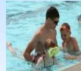
Spend quality family time together

2009 rates are the same as 2008! New membership options inside!