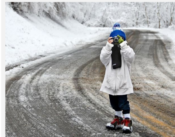
"Winter Photographer" by Mick Burke, 2011 Best of Show Winner.