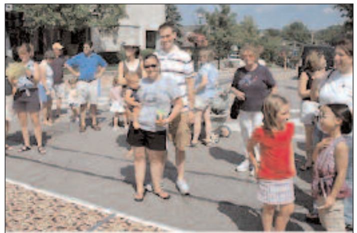
Visitors to this year's Bastille Day Celebration enjoyed great food, drinks, musical entertainment and fun activities for the children. Here the spectators prepare for the Diaper Derby.