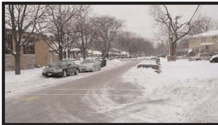
Snow plow required to plow around a parked car

Please remember that the Village does not maintain any roads that fall under the jurisdiction of another agency. Lincoln, Central, Cicero, Touhy, Devon, Crawford Avenue between Devon and Lincoln and McCormick Avenue are maintained by the Illinois Department of Transportation. Crawford Avenue from Lincoln to Jarvis is maintained by Cook County. To contact Cook County call (708) 485-7130 and IDOT call (847) 705-4000.