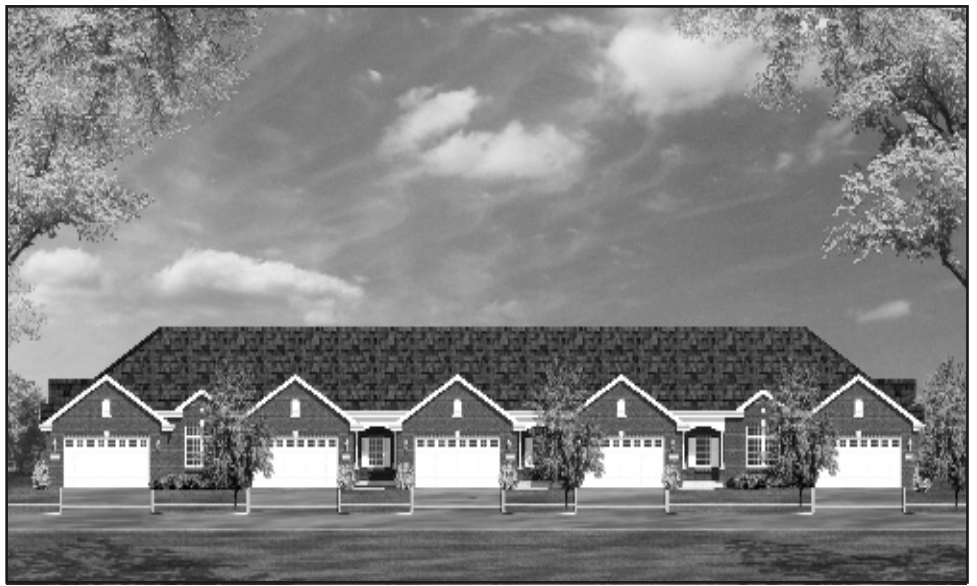
This is the artist rendering for Cedar Pointe, located at 193rd Place.