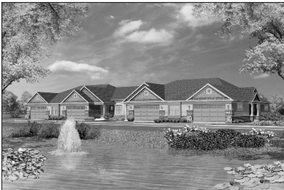
Spring Lake Villas features 69 townhouses at 177th and Lorenz.

Or call, (708) 307-7075. It is anticipated models will be available in May. The price range is $225,000 and up, depending on size and amenities selected. The units range from 1650 to 1700 square feet. A brochure detailing the various options may be printed off the Spring Lake Villas web site.