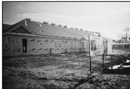
Models for Cedar Pointe will be ready in April.

Or call, (708) 307-7075. It is anticipated models will be available in May. The price range is $225,000 and up, depending on size and amenities selected. The units range from 1650 to 1700 square feet. A brochure detailing the various options may be printed off the Spring Lake Villas web site.