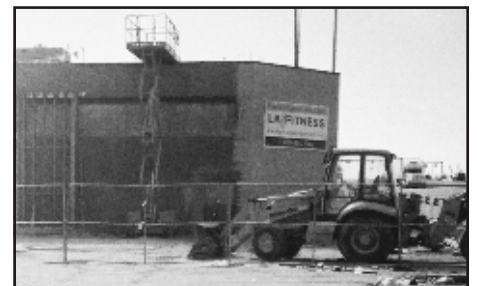
LA Fitness opens here at the end of April.

Worldwide Wireless of IL, Sprint/Nextel phone store. 2504 173rd St. Phone: 418-1299