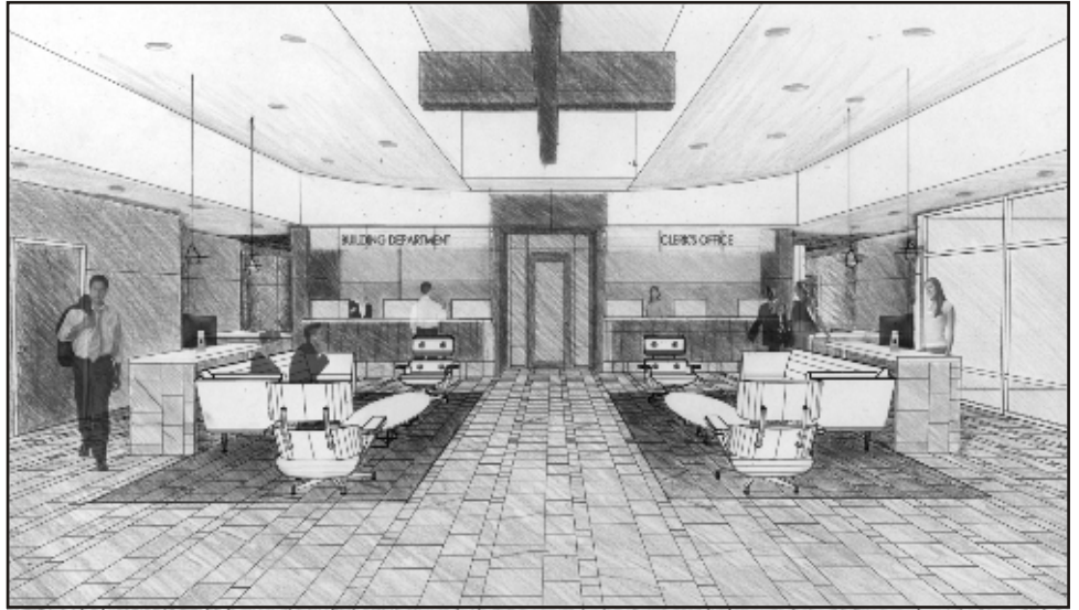
The Linden Group drawing of the new Municipal Center lobby.

After conducting an extensive space needs analysis, The Linden Group of Homewood prepared bid specifications. The new Lansing Municipal Center will provide outstanding office and meeting space and also improve the safety and security of office operations.