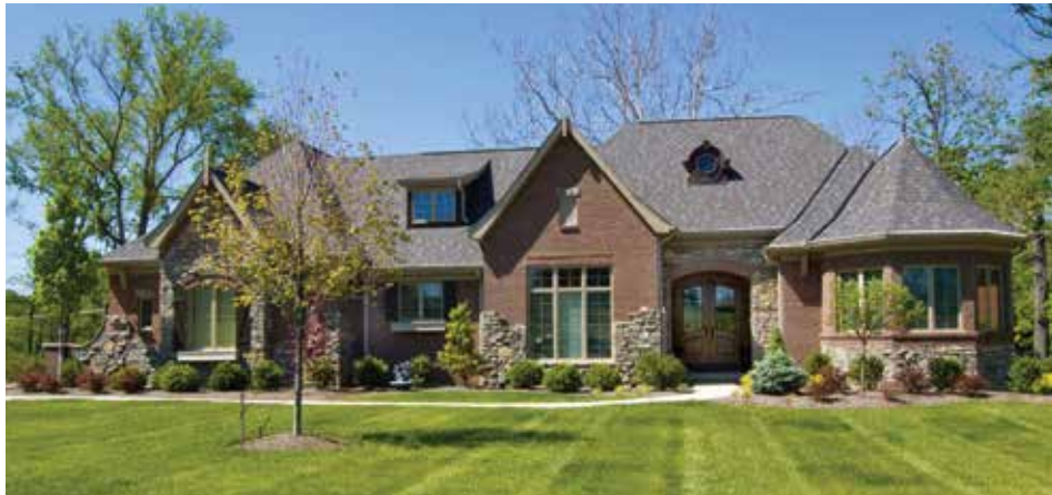
Greenshire Commons Estate Homes