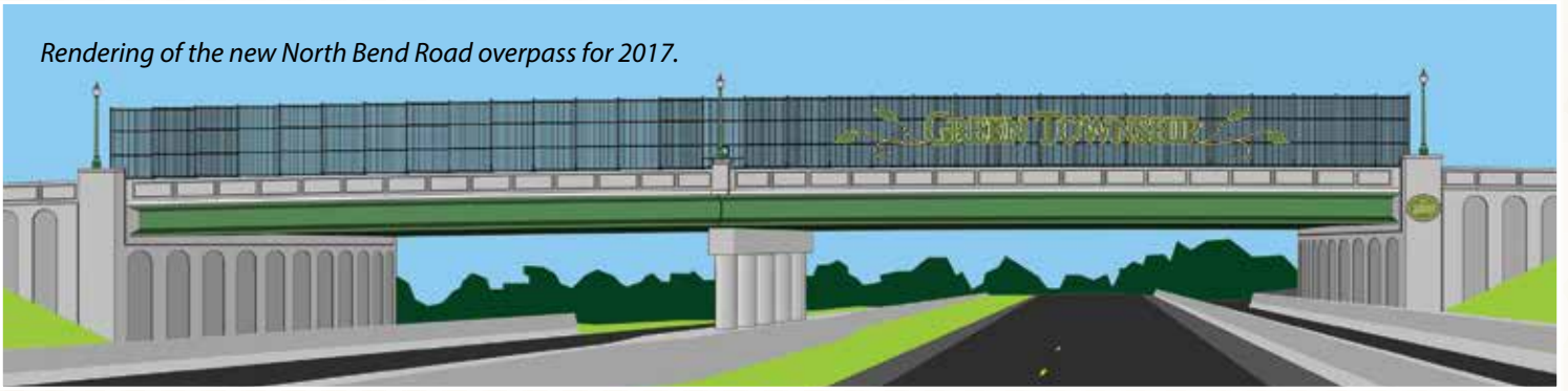
Rendering of the new North Bend Road overpass for 2017.

Green Township trustees are committed to investing in infrastructure and beautification in the commercial corridors to accommodate township growth. Recent partnerships with the Ohio Department of Transportation and Hamilton County Engineer will infuse more than $20 million in business corridors. Projects include widening the North Bend Bridge to improve access to the area's largest employers, and I-74 streetscape beautification.