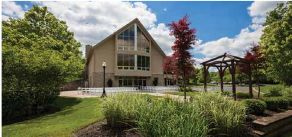
Nathanael Greene Lodge and Reception Hall is the perfect site to host your next event.