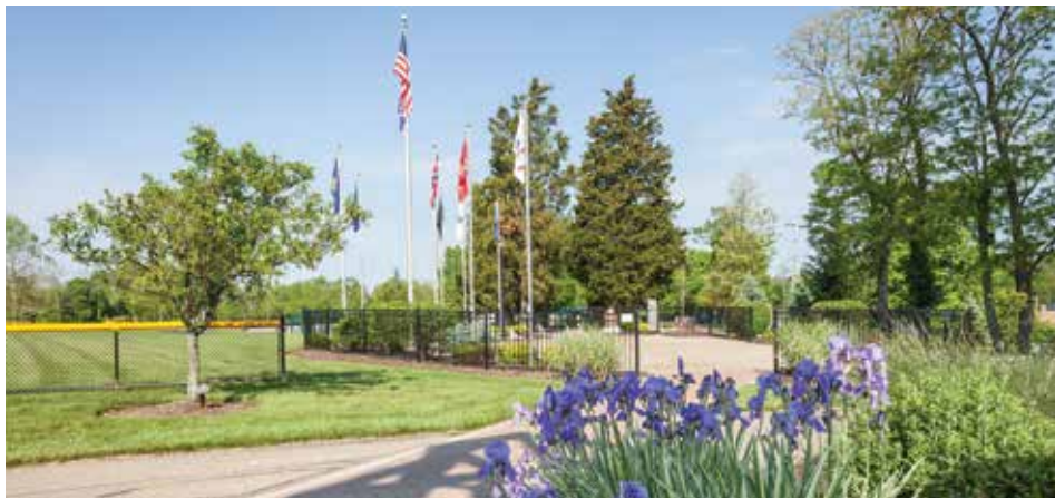
Veteran's Park offers walking paths, playing fields and beautiful landscaping.

The Cincinnati Art Museum boasts a collection of more than 60,000 objects, spanning 6,000 years of world art. Ranked 'Top Art Museum for Families' by Parenting magazine