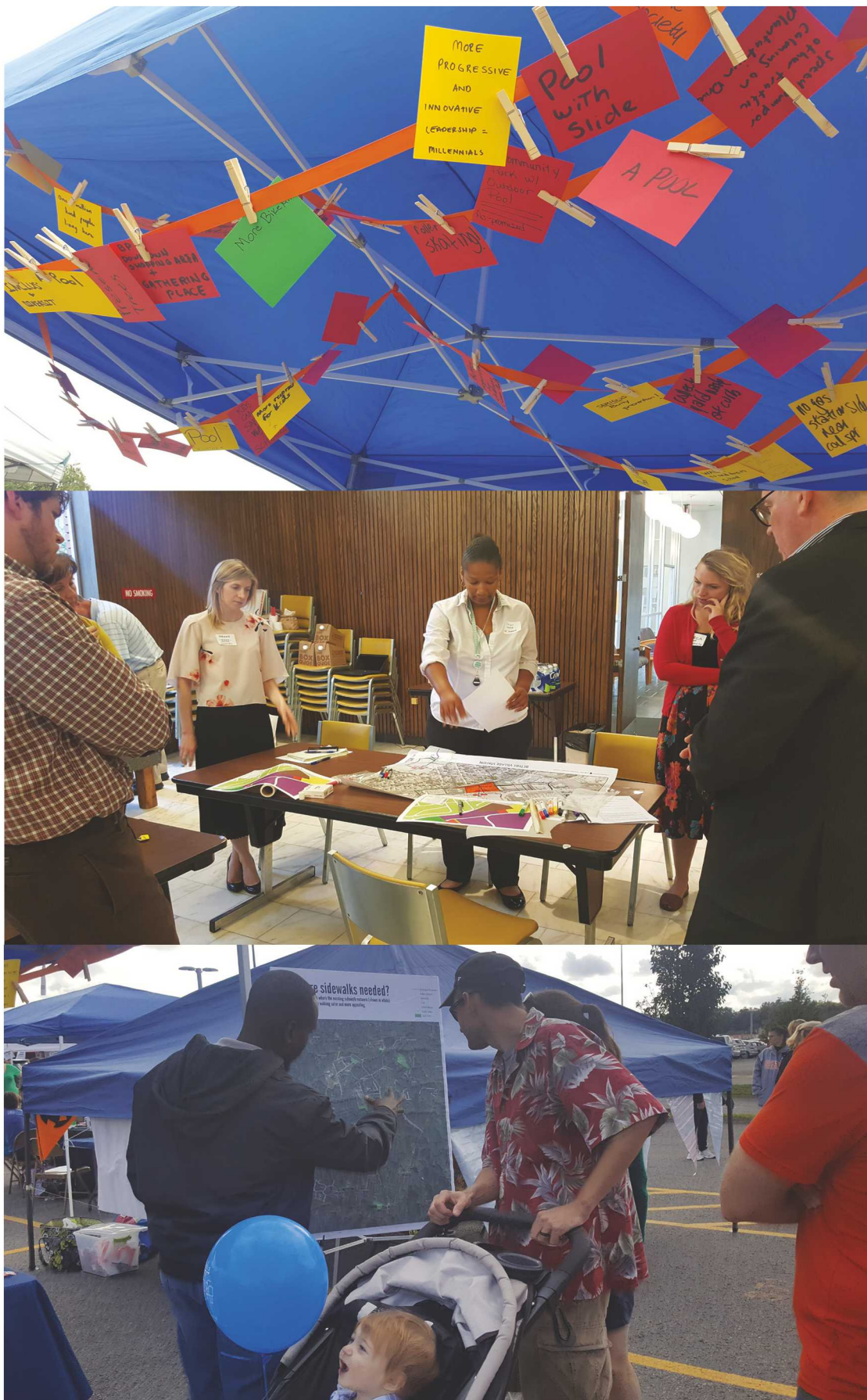
Community members provided input on broad and specific topics at a variety of community events and targeted focus groups.

Council adopts plan following public hearing